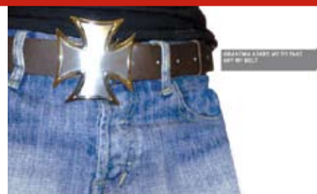
■ Postcard from the Yad Vashem and Wizo Haifa Academy joint exhibition, “Sign Posts: Postcards from the Edge” included in the “S’Cool Agenda” student diary

■ For the first time, Yad Vashem’s International School for Holocaust Studies and the European Union Agency for Fundamental Rights have cooperated in the creation of “S’Cool Agenda,” an awareness-raising school diary (datebook) for young people. As part of the European Year of Intercultural Dialogue, “S’Cool Agenda,” available in English, French and German, was produced to raise awareness among students about racism, xenophobia and other forms of discrimination. In addition to providing information about resources for