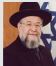
■ Rabbi Israel Meir Lau

Rabbi Lau was born in 1937 in Piotrków, Poland, the scion of a well-known European rabbinic family. During the early years of the war, he was incarcerated in the Piotrków ghetto. In October 1942, Lau's father and brothers, along with the majority of the Jews of their town, were deported to the Treblinka extermination camp, where they were murdered. Lau and his mother managed to escape the deportation. In November