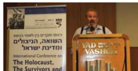
■ Dr. Ze'ev Mankowitz addresses the International Research Conference on the contribution of Holocaust survivors to the State of Israel

The Center seeks to promote scholarship and international projects on a number of planes, including the fate of the remnants of the Jewish communities in European countries and their countries of immigration; the ramifications of confronting the Holocaust in Israel and