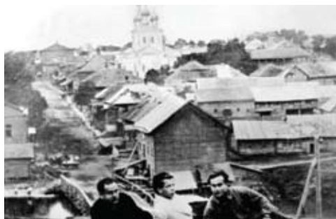
■ The town of Lyady, Belarus, in the 1930s.