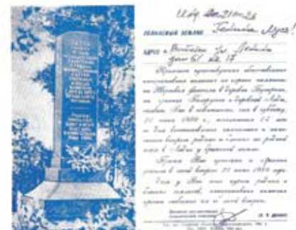
■ Invitation to the memorial ceremony at the Mereya murder site, Lyady, 1980.

For many years, the separation and isolation mandated by the Soviet authorities pushed their stories to the margins of historiography