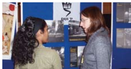
■ Yad Vashem booth at “Diversity Day” in Vienna, attended by 2,000 European youth

The intensive two-day seminar, held over the 70 th anniversary of the Kristallnacht pogrom, aimed to establish a link between teaching about human rights and Holocaust education. In addition to presentations and discussions, the participants held group dialogues to prepare annual programs. Most popular were national and multi-national projects, part of the European struggle against antisemitism and violations of human rights.