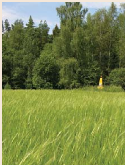
■ Monument to the Jews of Staroselye, Belarus.

The film documenting the murder of the Jews of Liepaja, the video testimony of the man who filmed it, as well as dozens of video testimonies of survivors, some of whom escaped from the mass graves, and the testimony of the locals who watched it happen, are all part of the vast research project now available to visitors to the Yad Vashem website.