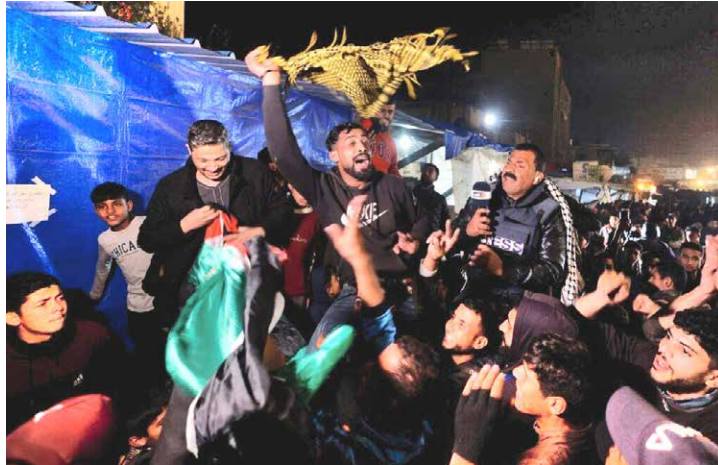
Los palestinos celebran el alto el fuego en Khan Younis, sur de Gaza, 15 de enero de 2025.

Tras haber ocupado ilegalmente la Gran Palestina desde 1948, los