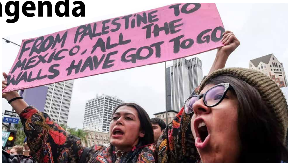
Mass protests pushed back against anti-migrant policies during the first Trump administration. Feb, 22, 2017, Los Angeles.

The hate-monger Trump took his oath of office with his hand on – not one, but two – Bibles, his late mother's and the one President Abraham Lincoln purportedly used in his inauguration. References to the biblical god permeated the entire ceremony, from the invocation by Rev.