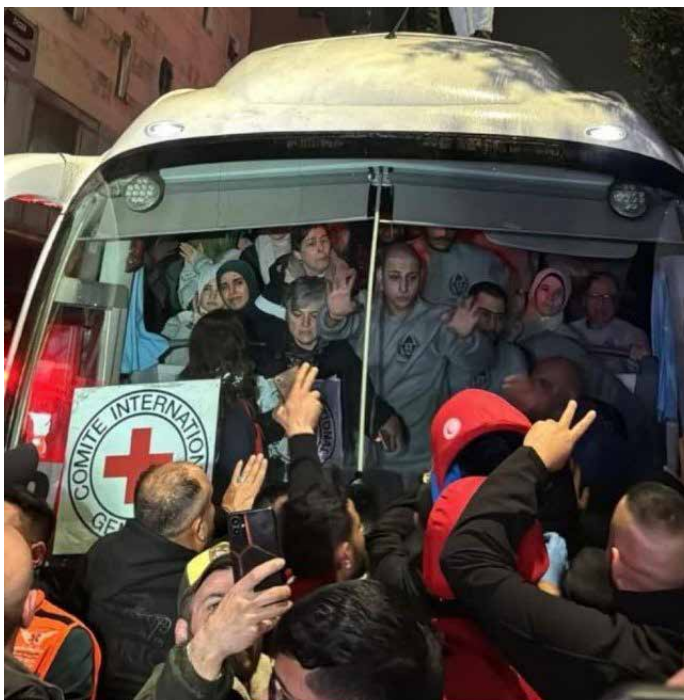
Palestinian women hostages released, Jan. 19, 2025.

Prime Minister Benjamin Netanyahu and General Yoav Gallant remain two Israeli war criminals facing charges at the International Criminal Court. The journalists who confronted the outgoing U.S. Secretary of State Antony Blinken at his