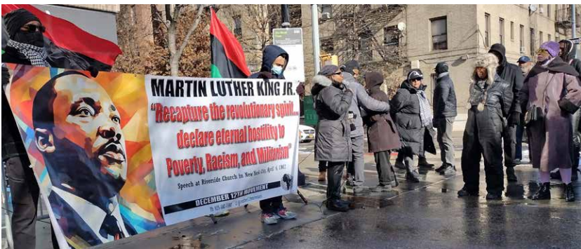
March called by December 12 Movement, Brooklyn, New York, Jan. 20, 2025.