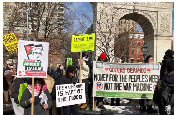
New York City march, Jan. 20, 2025.