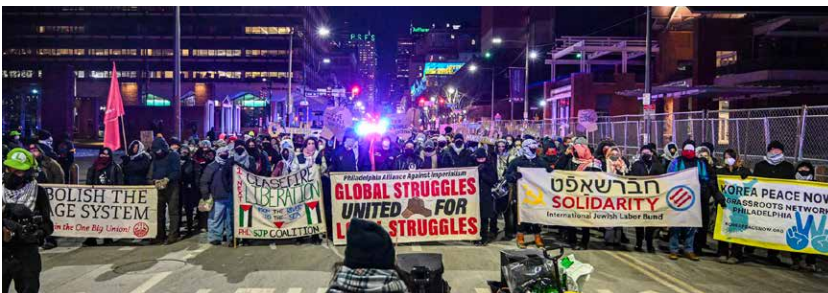
Martin Luther King Day counter-inaugural march, Philadelphia, Jan. 20, 2025. Read roundup online.