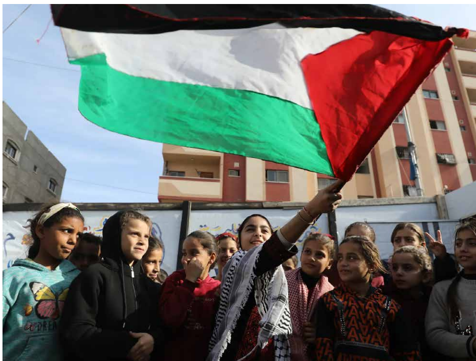
Palestinians celebrate ceasefire in Gaza.

Despite enormous hardship and even facing famine, the people of Gaza have refused to be expelled to the south. In resistance, in guerrilla