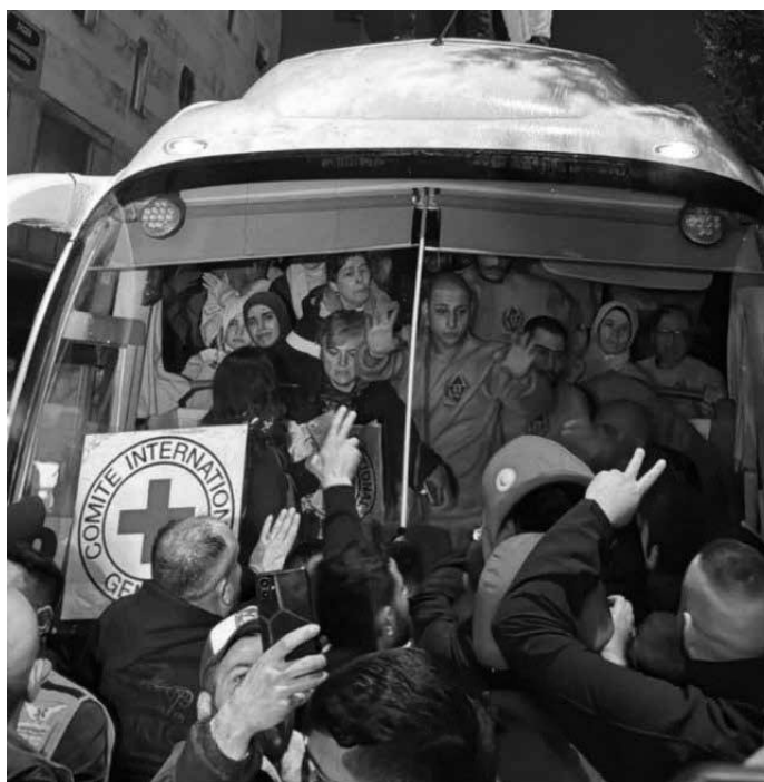
Palestinian women hostages released, Jan. 19, 2025.

Prime Minister Benjamin Netanyahu and General Yoav Gallant remain two Israeli war criminals facing charges at the International Criminal Court. The journalists who confronted the outgoing U.S. Secretary of State Antony Blinken at his