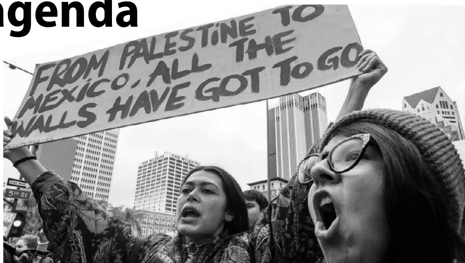
Mass protests pushed back against anti-migrant policies during the first Trump administration. Feb, 22, 2017, Los Angeles.

The hate-monger Trump took his oath of office with his hand on – not one, but two – Bibles, his late mother's and the one President Abraham Lincoln purportedly used in his inauguration. References to the biblical god permeated the entire ceremony, from the invocation by Rev.