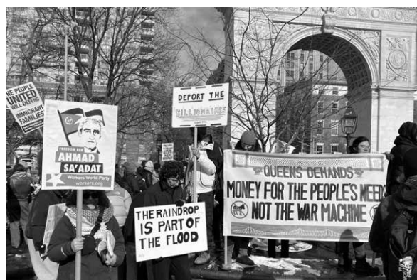
New York City march, Jan. 20, 2025.