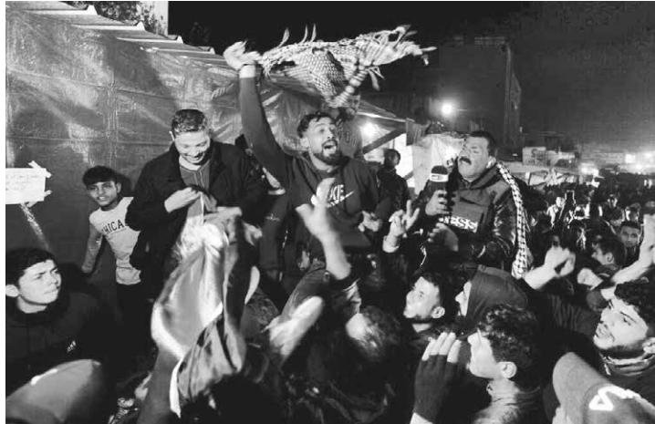
Los palestinos celebran el alto el fuego en Khan Younis, sur de Gaza, 15 de enero de 2025.

Tras 15 meses de destrucción despiadada, financiada por Estados Unidos, por parte de las Fuerzas de Ocupación de Israel de todas las ciudades, incluidos todos los hospitales, escuelas, incendiando tiendas de campaña y más de 64.000 muertes oficiales en Gaza, el Movimiento de Resistencia Islámica Hamás, en consulta con representantes de las demás facciones palestinas, anunció el 15 de enero que se había alcanzado un