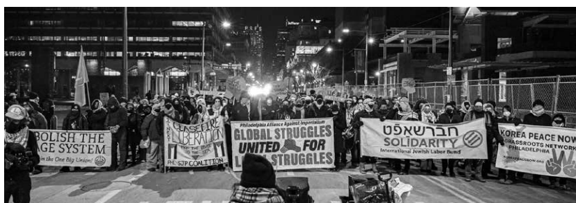
Martin Luther King Day counter-inaugural march, Philadelphia, Jan. 20, 2025. Read roundup online.