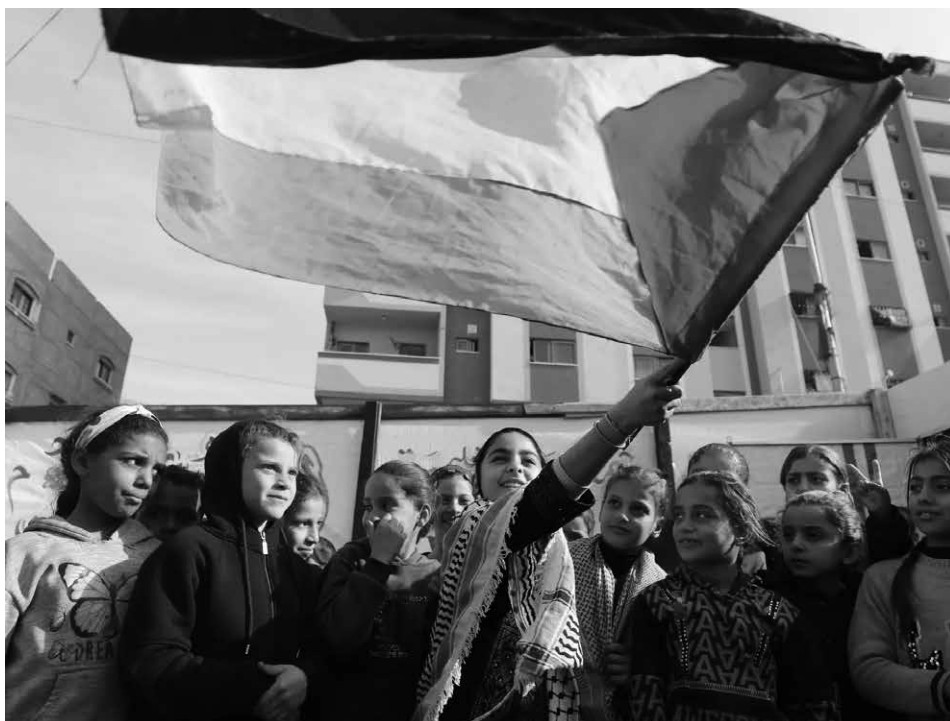
Palestinians celebrate ceasefire in Gaza.

Despite enormous hardship and even facing famine, the people of Gaza have refused to be expelled to the south. In resistance, in guerrilla