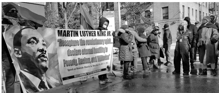
March called by December 12 Movement, Brooklyn, New York, Jan. 20, 2025.