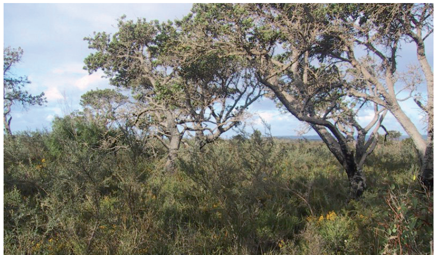
typical honey possum habitat, in Scott National Park