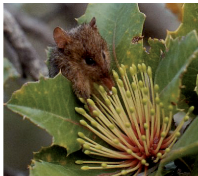
honey possum feeding on flowers of Banksia ilicifolia