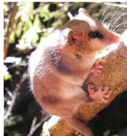
Dromiciops gliroides , perhaps the honey possum's closest relative