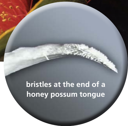
bristles at the end of a honey possum tongue

Honey possums are one of the world's smallest marsupials. With their long snouts, pink prehensile tails and beady black eyes they can easily be mistaken for a mouse. But the honey possum isn't a mouse: in fact, it's not even a possum and it doesn't eat honey!