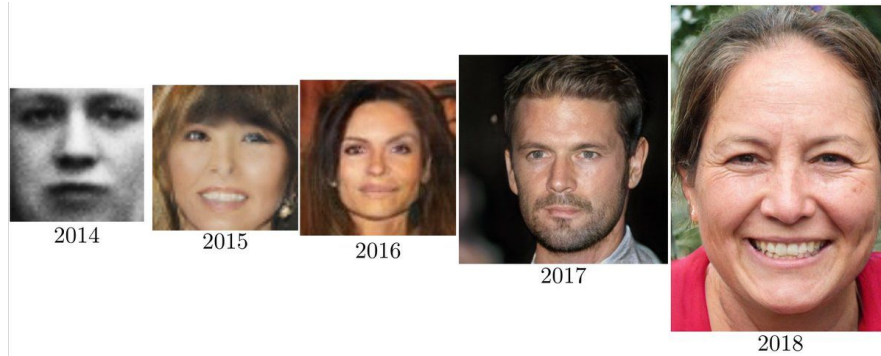
Figure 1: Rapid progress in synthetic generation of human faces via generative adversarial networks (“GANs”). 9

Progress in text generation has been similarly dramatic, as this table indicates: