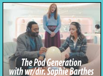
PHOTO CREDITS: Hilma - Courtesy of Juno Films; Ellis - Courtesy of Sascha Just; Chevalier - Courtesy of Searchlight Pictures; Judy Blume Forever - Courtesy of Prime Video; Little Richard: I Am Everything - Courtesy of Magnolia Pictures; Gold Run - Courtesy of Juno Films; Carmen - Courtesy of Sony Pictures Classics; Reykjavik - Courtesy of Lizzy Kimball; The Pod Generation - Courtesy of Roadside Attractions.