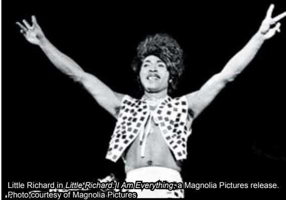
Little Richard in Little Richard: I Am Everything, a Magnolia Pictures release.