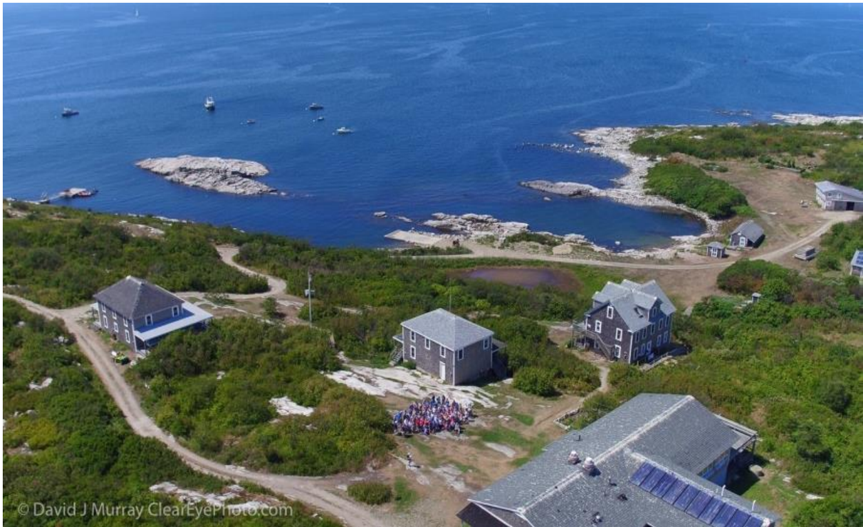
UNH's Appledore Island (isle of shoals classroom)