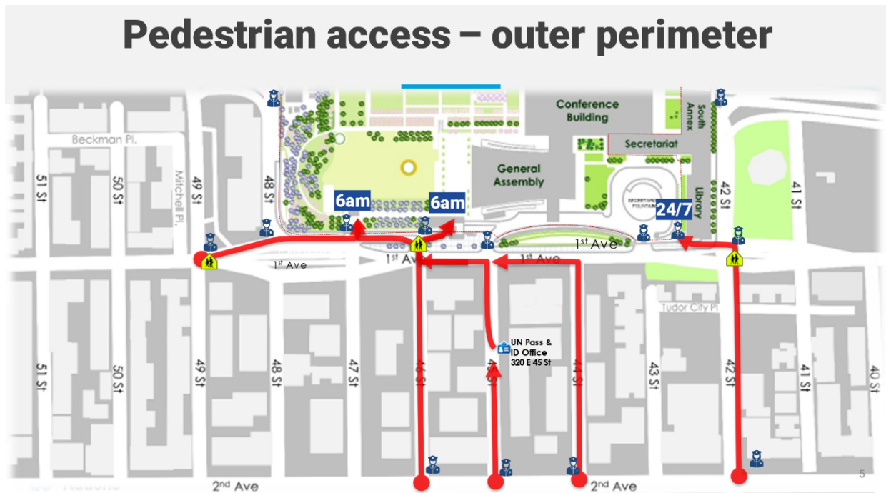
Figure 1: Pedestrian access - outer perimeter

For information on the access and participation of delegations, civil society, and media, please refer to the UNGA 78 Information Note available online.