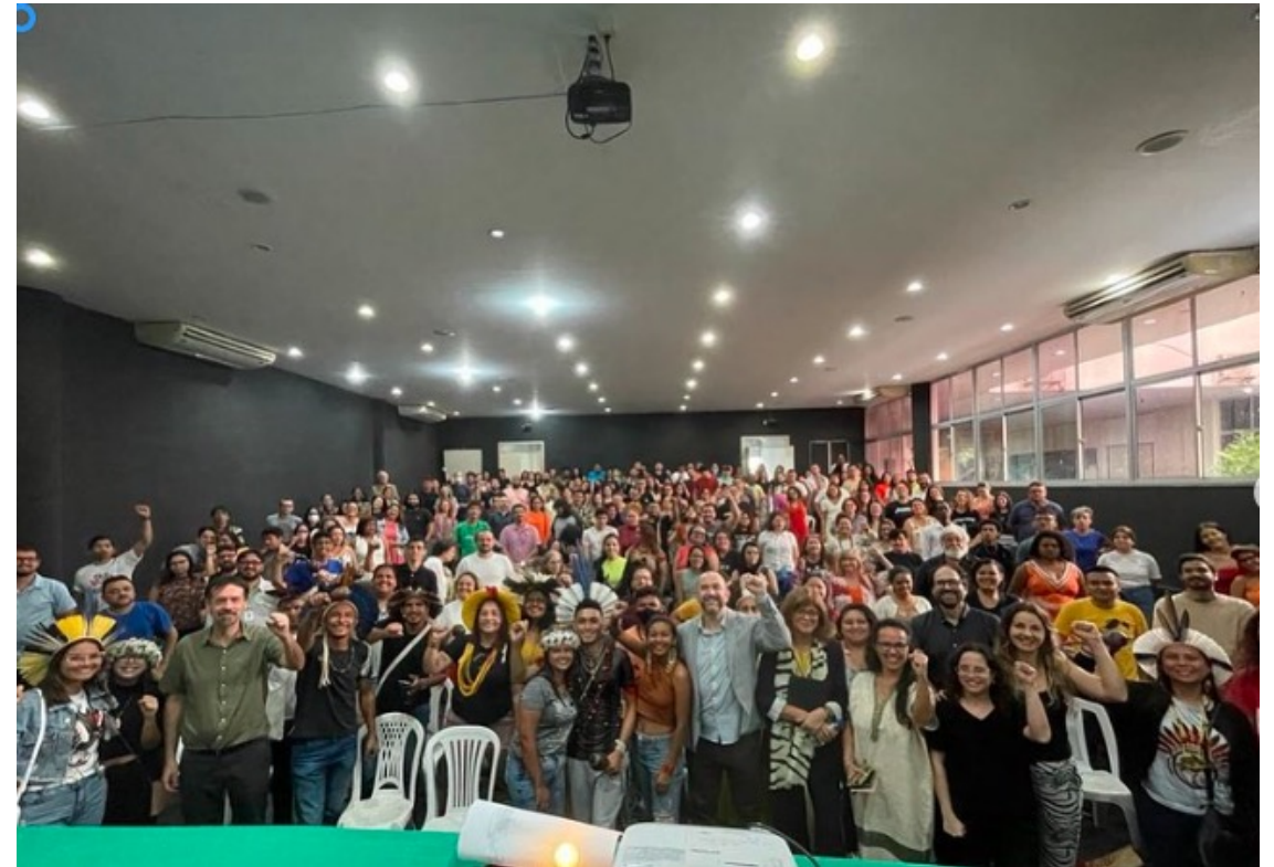
CLACSO Forum of participatory Science: "Social Movements and Territories for Life" in Fortaleza, Brazil.