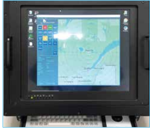
Upgraded PPI Display

Legacy displays will be replaced with our new touchscreen LCDs to deliver significant usability enhancements, including software that provides superior tactical interfaces for operators. All tracked and untracked videos are output from the video processor as ASTERIX Ethernet signals in CAT-240. The additional capabilities added to the AN/TPS-70 signal and post-processing functions include ADS-B data incorporated and available at the output and on the display. Legacy maintenance display functions can optionally be integrated into and handled by the TSS PPI display. A 3D Tracker is also an available option.