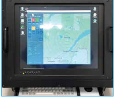
Upgraded PPI Display

Legacy displays are replaced with our new touchscreen LCDs to deliver significant usability enhancements, including software that provides superior tactical interfaces for operators. All tracked and untracked videos are output from the video processor as ASTERIX Ethernet signals in CAT-240. The additional capabilities added to the AN/TPS-43 signal and post-processing functions include ADS-B data incorporated and available at the output and on the display. Legacy maintenance display functions can optionally be integrated into and handled by the TSS PPI display. A 3D Tracker is an available option.