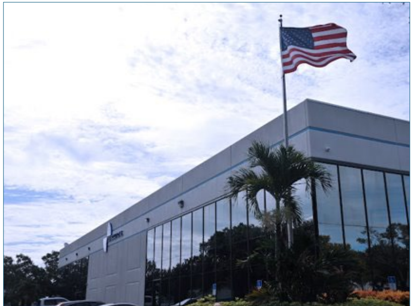
TSS Solutions' Corporate Headquarters is on Florida's Space Coast.

We currently employ 100 professionals (roughly half have a Secret clearance, and some have a TS/SCI clearance). Although a small company, TSS Solutions enjoys the financial stability of a larger corporation.