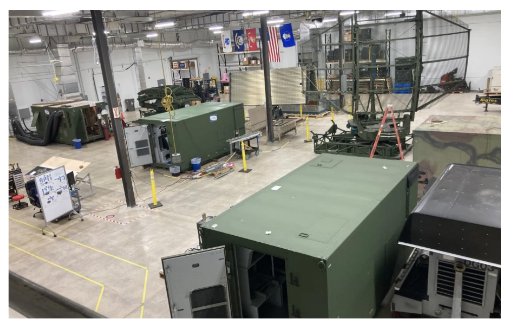
TSS Solutions' facilities in Melbourne, FL.