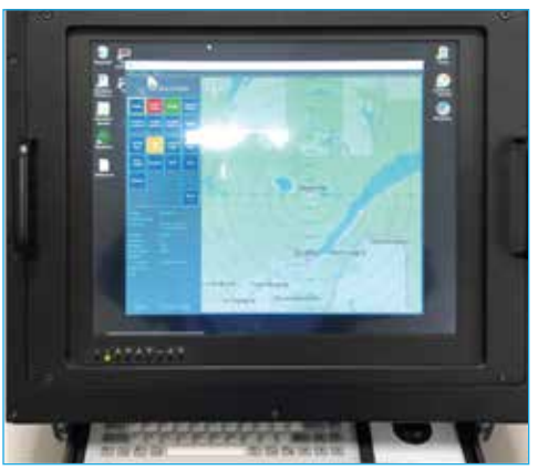
Upgraded PPI Display

Legacy displays will be replaced with our new touchscreen LCDs to deliver significant usability enhancements, including software that provides superior tactical interfaces for operators. All tracked and untracked videos are output from the video processor as ASTERIX Ethernet signals in CAT-240. The additional capabilities added to the AN/TPS-75 signal and post-processing functions include ADS-B data incorporated and available at the output and on the display. Legacy maintenance display functions can optionally be integrated into and handled by the TSS PPI display. A 3D Tracker is also an available option.