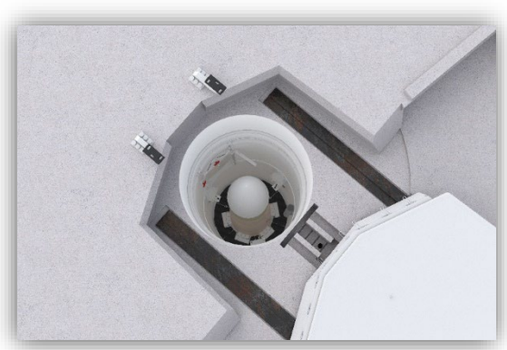
Illustration of the LGM-35A Sentinel missile silo. U.S. Air Force illustration.

Another capability difference owing to the Sentinel's modular design could be improved security at nuclear launch facilities. According to the Air Force, maintenance on the MMIII currently requires the launcher closure door, the door between the missile and the outside world, to be open, creating security concerns around unauthorized access or observation. The Air Force currently addresses these concerns by increasing security around the warhead while the doors are open. The Sentinel's modular design, however, could allow some of the maintenance to take place behind closed doors, mitigating the security concerns. That, in turn, could also mean fewer security personnel are needed to conduct maintenance, potentially reducing costs.<sup>17</sup>