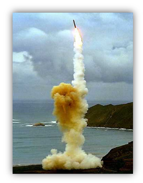
Minuteman III test launch at Vandenberg Air Force Base, California.

Minuteman III (MMIII) ICBMs, the version of these missiles currently deployed at nuclear launch facilities, were first deployed in the early 1970s. It was the first ICBM equipped with multiple independently