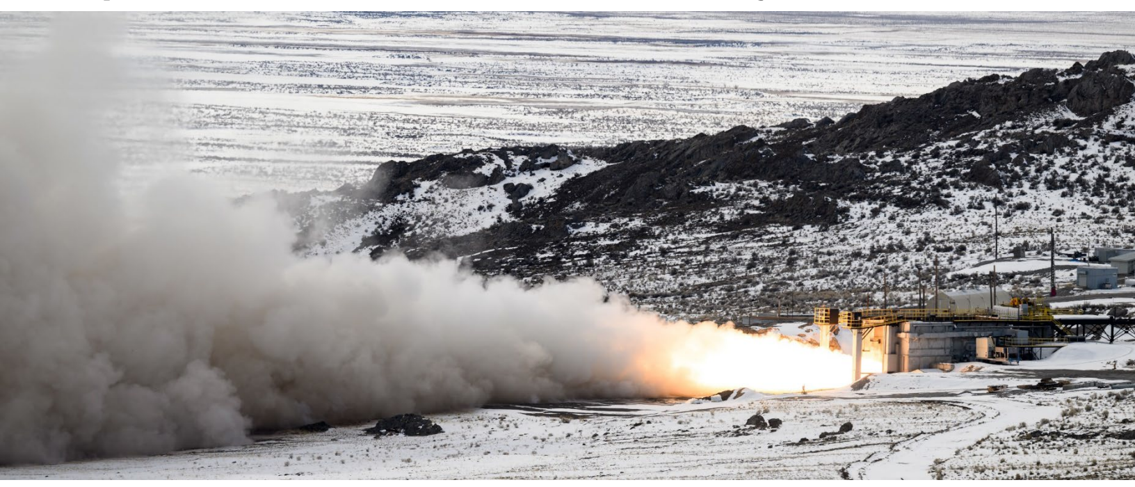
At Northrop Grumman's test facility in Promontory, UT, the Air Force Nuclear Weapons Center conducted its first full-scale test fire of the LGM-35A Sentinel stage-one solid rocket motor on March 2, 2023. The Sentinel ICBM is projected to cost taxpayers roughly $315 billion over the course of its lifecycle.