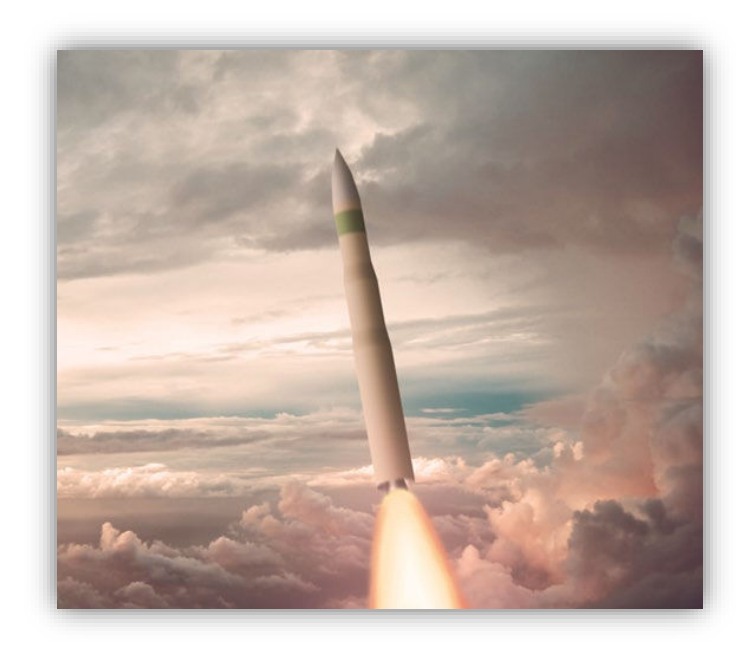
Illustration of LGM-35A Sentinel missile in flight. U.S. Air Force illustration.

However, maintaining a more explosive arsenal is not the primary argument employed by proponents of