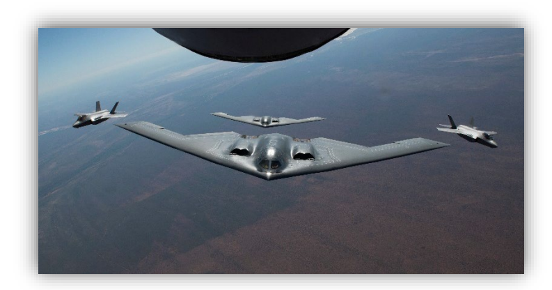
Two U.S. Air Force B-2 Spirit Bombers flew a bomber task force mission alongside two Royal Australian Air Force F-35s during an exercise over Royal Australian Air Force Base Curtin, Australia, July 18, 2022.

Moreover, regardless of which leg of the triad is most visible, the benefits of visibility are dubious at best.