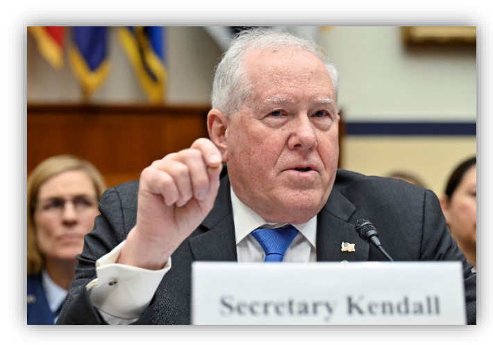
Air Force Secretary Frank Kendall testifies before the House Armed Services Committee for the Department of the Air Force FY25 budget request, Washington, D.C., April 17, 2024.

According to Undersecretary Jones, the increased cost is rooted "primarily in the civil works aspects of the program," in other words, the infrastructure to support the program rather than the missiles themselves. She cited inflation, supply chain issues, and labor costs as contributing factors to the cost growth.<sup>33</sup>