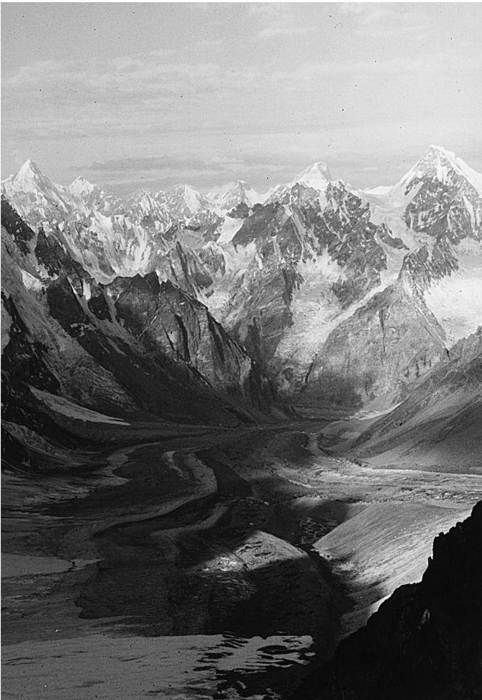
FIGURE 2 Typical Ibex habitat north of Hushe village. Ibex graze on the vegetation found in glaciated valley bottoms and on mountain spurs.

to stalk ibex on Hushe lands (Figure 2). Ibex are a valued trophy within the international hunting community, and the hope was that opening a limited market for the hunt would bring substantial funds into the community. Eventually the government approved a limited hunt, with the agreement that 75 per cent of the proceeds from the sale of the permits would go to the village while the remainder would go to the government. 12 The marketing of permits takes place largely through the annual convention of Safari Club International, an organization of relatively wealthy hunters. 13 Approval was also given by CITES to transport the carcass of a trophy animal to the hunter's country of origin. 14 In Hushe, it was decided that during the first year, money from the sale of permits would be distributed equitably among the 100 village