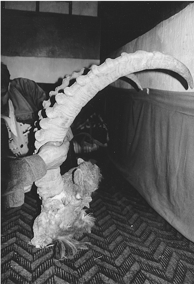
FIGURE 3 The head of an adult male ibex, approximately 10 years old. The meat from this animal was distributed within the village and the skin was made into a backpack for carrying grain.

people significant to the hunter as a means of wishing them good health and commenting on the continued significance of their authority. Ibex meat is also distributed amongst filial and fictive kin as a means of expressing a social commitment to their wellbeing and fostering strategic allegiances. Just as ibex have symbolic value for villagers, they also hold symbolic value for international trophy hunters. Far from being interested in conservation, trophy hunting is motivated by wildlife as an object of desire. This desire is not a purely individualized phenomenon, however, but is fed by a particular reward structure within a 'community' of hunters. International trophy hunting has status value which is reflected in the sanctioning structures of organizations like Safari Club International or the Grand Slam Club, which offer awards to hunters