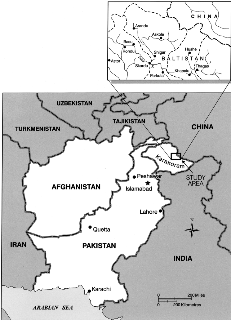
FIGURE 1 Pakistan and study area

(Figure 1). Most inhabitants live in small villages lining the tributary valleys to the Indus and Hunza Rivers, engage in subsistence agro-pastoralism, and continue to focus on internal modes of production, distribution and consumption. 10 For centuries, the Hushpong have supplemented their cereal-based diet by hunting ibex ( Capra ibex ), a large mountain goat. In 1996 the World Conservation Union 11 (IUCN) approached village leaders in Hushe with a plan. If the village leaders would agree to prevent villagers from hunting ibex, IUCN would pursue an agreement with the government of Pakistan and the Convention on International Trade in Endangered Species of Wild Fauna and Flora (CITES) that would permit the sale of permits for international hunters