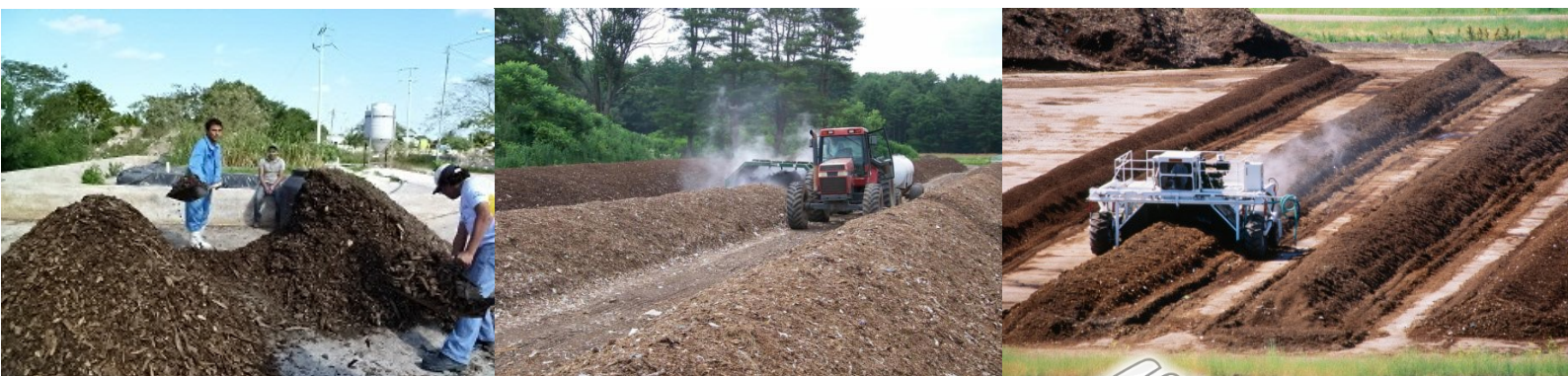
Assessment of the Windrow System

Open systems are the lowest cost option and, when managed correctly, produce a high-quality product. Due to low technology requirements and scalability, they are highly suited to the Pacific island context .