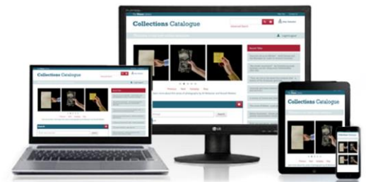
Designed for Desktop, Tablet & Mobile

Single or multiple search portals are easily created to cater for the information needs of discrete user communities. The library is able to direct content to the patrons that it serves and present web pages with appropriate content and links to internal or external resources.