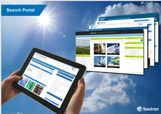
Search Portal for patron access