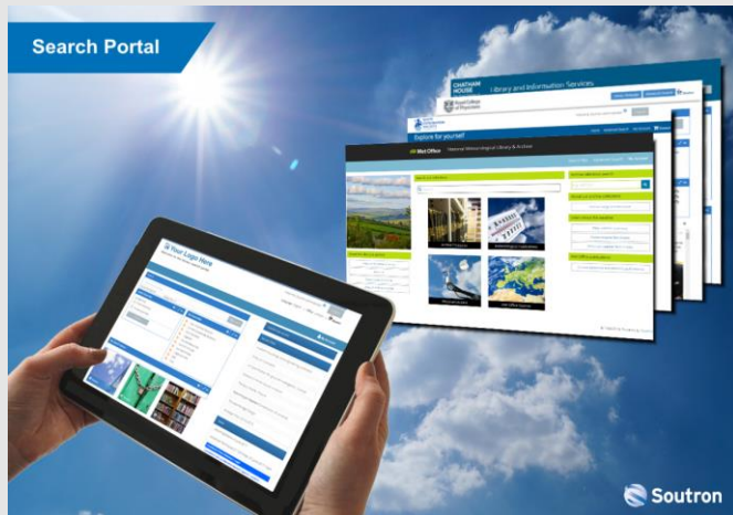
End User Search Portal