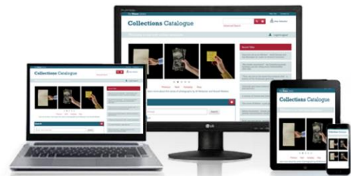
Designed for Desktop, Tablet & Mobile

Single or multiple search portals are easily created to cater for the information needs of discrete user communities. Staff are able to direct content to the customers that it serves and present web pages with appropriate content and links to internal or external resources.