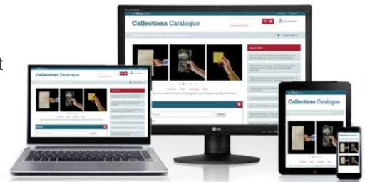
Designed for Desktop, Tablet & Mobile

Single or multiple search portals are easily created to cater for the information needs of discrete user communities. The library is able to direct content to the customers that it serves and present web pages with appropriate content and links to internal or external resources.