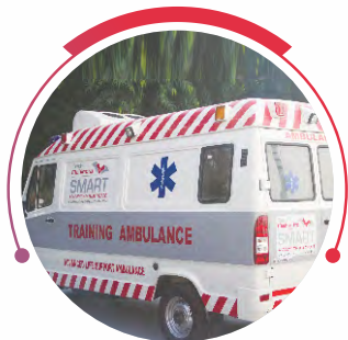
ADVANCED LIFE SUPPORT AMBULANCE