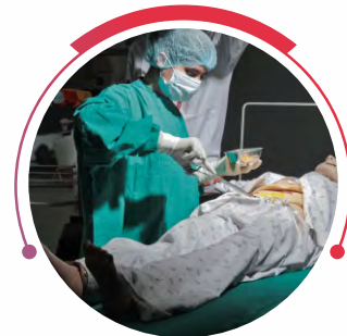
OPERATION THEATRE LAB