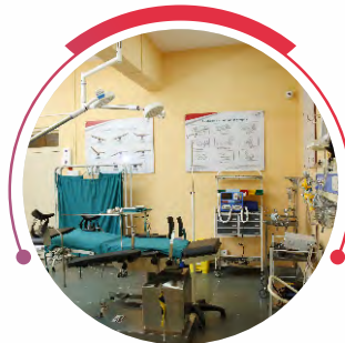
BASIC SKILLS LAB