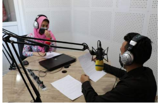
Frequent broadcasts about the virus

Radio Meraj has been instrumental in spreading information about COVID-19 and aiding AIL's health department in its efforts to educate, inform, and encourage people to treat the virus with great caution. The station aired thousands of ads about the virus. The audience received donations of masks, sanitization supplies, and health packages. Women were encouraged to sew face masks and encourage hand washing.