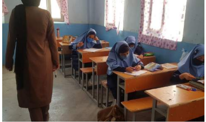
Socially distanced classroom

AIL supports computing and coding classes and the intensive two-year Youth Leaders Course. Students learn about a variety of leadership topics as well as other subjects such as English, politics, democracy, and community projects. They do course work, reading, and presentations, and engage in field trips such as visiting an AIL Learning Center, community clean-ups, and visiting Radio Meraj.