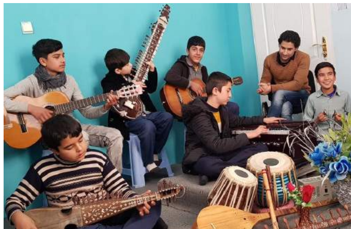
Music education is part of the curriculum