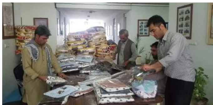
Preparing aid packages

AIL provides emergency food aid parcels when needed due to natural disasters such as drought, floods, and extreme winter weather. Food supplies include items such as oil, beans, rice, eggs, milk, dates, meat, bread, tea, and sugar. Recipients are identified by leaders in the local communities that we support. AIL also provides household items when possible. In August when there was severe flooding in Parwan Province, AIL distributed blankets, floor mats, shovels, and clothing were given to impacted families.