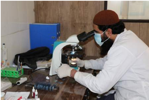
Clinical laboratory work

COVID-19 necessitated changes at the clinics with regard to sanitation procedures and an increase in demand as several other local clinics shut down. Staff worked extra hours to accommodate patient care, with COVID-19 patients being referred to government hospitals and other patients being treated in house by AIL staff.