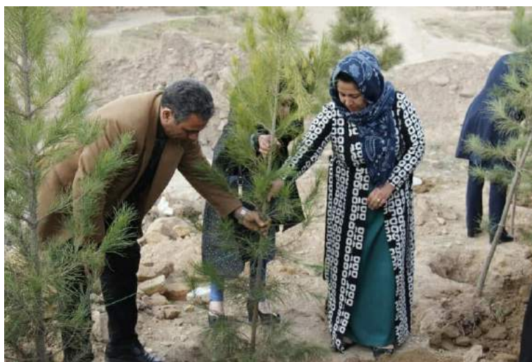
WEG plants trees

Recognizing the importance of environmental literacy even during the pandemic, AIL strived this year to ensure that people were educated on a multitude of topics related to caring for the Earth and their local environment. Activities and topics included tree planting, distributing information about the virus, local markets and farmers, awareness of air, water, sound, light pollution, and waste disposal.