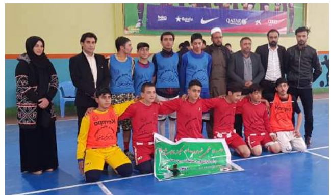
Students enjoy participating in team sports