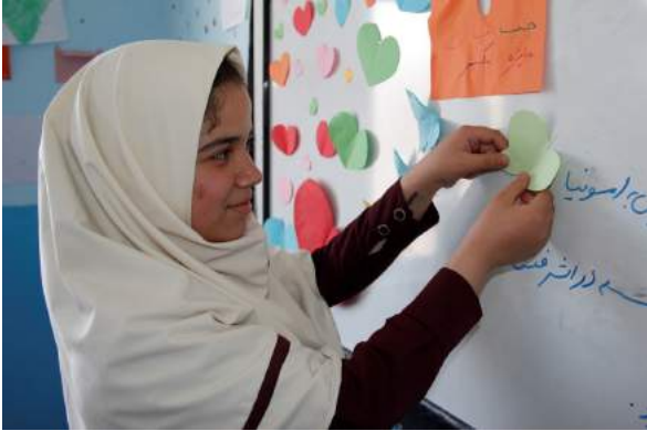
Yacoobi Private School student