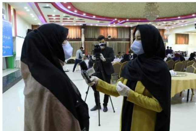
TV Meraj reporters in the field