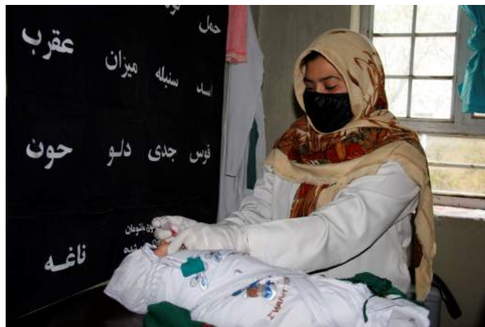
Healthcare services during the pandemic

Our health program provided 231,038 health treatments in 2020. There are six main clinics, including one at an orphanage, and one at a center for the disabled. Outside of the main clinics, there are outreach clinics at five AIL Learning Centers and 14 Community Health Worker (CHW) posts. Each clinic provides medical treatment, reproductive health services, nutrition care, preventive care, pre and post-natal care, and health education. AIL has always combined its quality healthcare with health education so that all clinic patients and their families leave their visit well-informed.