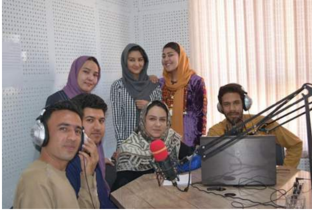
The Radio Meraj team

Radio Meraj is an award-winning private station set up to reach people with education, news, and information programming and to expand the reach of AIL's message. The station is housed in AIL Herat's office and AIL staff assists with programming. Programs are broadcast 18 hours a day from 6 am to midnight. It is estimated that the station broadcasts to an area with 2 million residents in seven of eight districts of Herat Province. It is a more progressive radio station than its competitors. When you get in a taxi in Herat, it is highly likely that you will hear Radio Meraj!