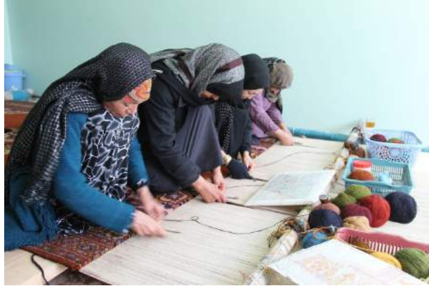
Carpet weaving is keeping traditional culture alive and empowering women to have a sustainable life

Culture Revival has been at the core of AIL’s goals for a long time. Cultural revival aims to help Afghans recover their culture, sense of history, and historic tradition as a peaceful society. AIL offers classes in traditional Afghan arts and crafts such as carpet weaving, embroidery, tile making, glasswork, calligraphy, and miniature painting. AIL has one center in Herat’s historic complex, the Citadel, which focuses solely on traditional arts and crafts. Afghan poetry is also promoted at its Love and Forgiveness Conferences, the poetry is incorporated into the AIL curriculum.