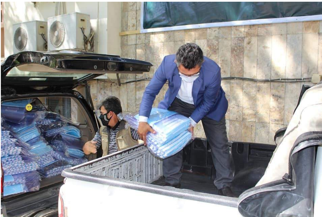
Delivering PPE door to door