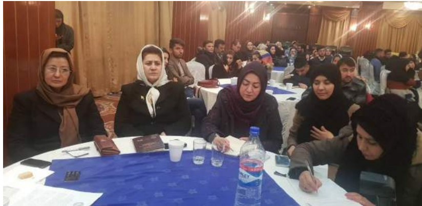
Peace and Leadership Conference

"This workshop has helped me to understand what leadership is and it inspired me to apply for jobs I feel I can handle anything that might come up. I see all things in a positive way and I feel very confident in making my own decisions. I am now the manager of a Learning Center in Balkh and I love my job. I also appreciate how women must avoid all harassment and focus on the job and work to that end." (Workshop participant)