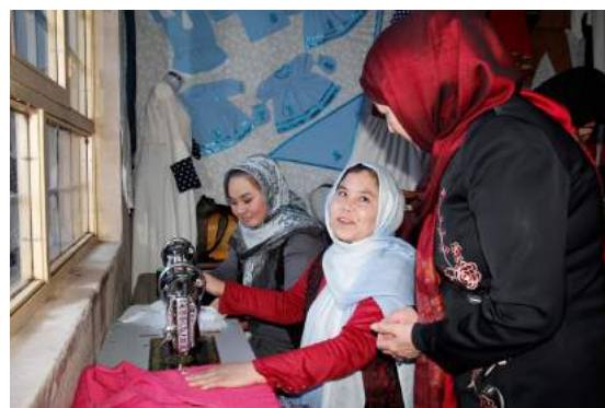
Tailoring is a skill that can lead to starting a small business