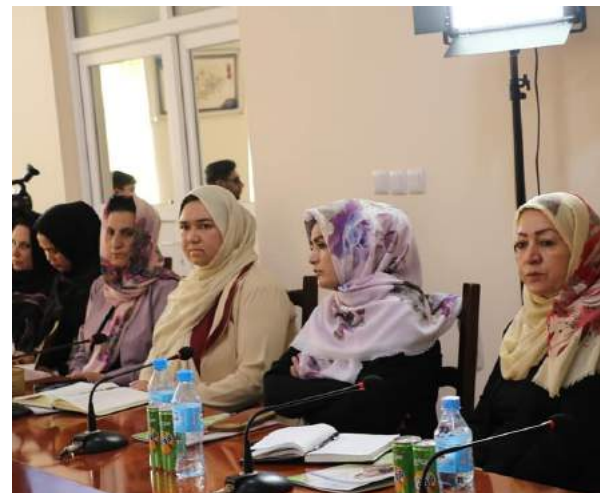
The Research Center presents an E-learning paper

AIL's cultural section worked on designs for new books. AIL publishes books and teaching manuals to support its educational programs such as teacher training, the Women's Empowerment Group, and mobile literacy.