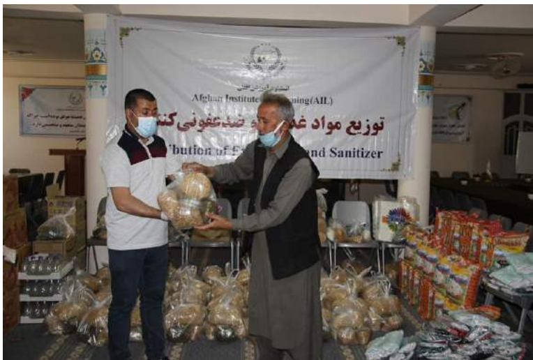
Food packages distributed