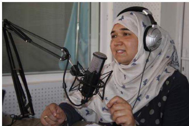
Awareness through Radio Meraj

In 2020, the legal clinic handled 66 cases. The majority of cases are concluded within a month. The cases included issues such as robbery, divorce, kidnapping, violence against women, traffic accidents, business, inheritance, child abuse, alimony, early marriage, and drug trafficking. The lawyers participated 48 times in a legal awareness show on Radio Meraj, informing women and men of their rights, educating people on the laws of the country, and responding to call-in questions.