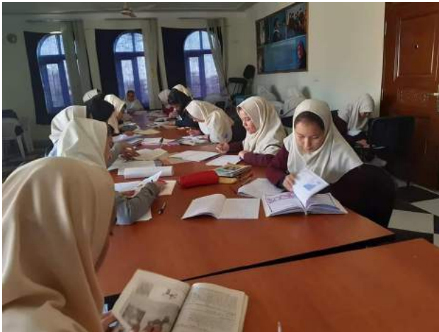
The Youth Leaders Course

AIL supports computing and coding classes and the intensive two-year Youth Leaders Course. Students learn about a variety of leadership topics as well as other subjects such as English, politics, democracy, and community projects. They do course work, reading, and presentations, and engage in field trips such as visiting an AIL Learning Center, community clean-ups, and visiting Radio Meraj.