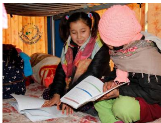
Children at school