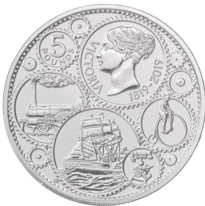
The 200th Anniversary of the Birth of Queen Victoria