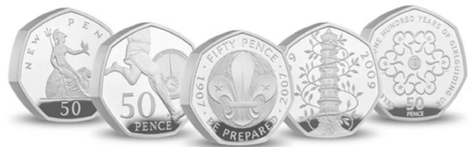
50 Years of the 50p