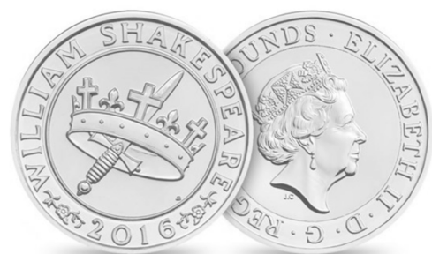
The 400th Anniversary of the Death of William Shakespeare