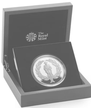
The First World War Centenary