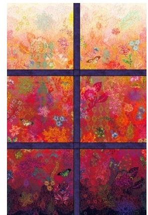
Step 5 Quilt Center ↑