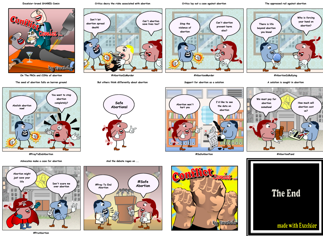
Figure 1: An Excelsior! comic on the topic of abortion. Stance reversal occurs in the 2 nd panel of row 2.

samples the narrative space to cumulatively reflect the relative popularity of different views. A sample comic, generated for the topic abortion , is presented in Fig. 1. Notice how the comic balances pro- and anti-stances on abortion across panels, but also employs dialogue responses within panels to temper and sometimes challenge the assertions of individual hashtags.