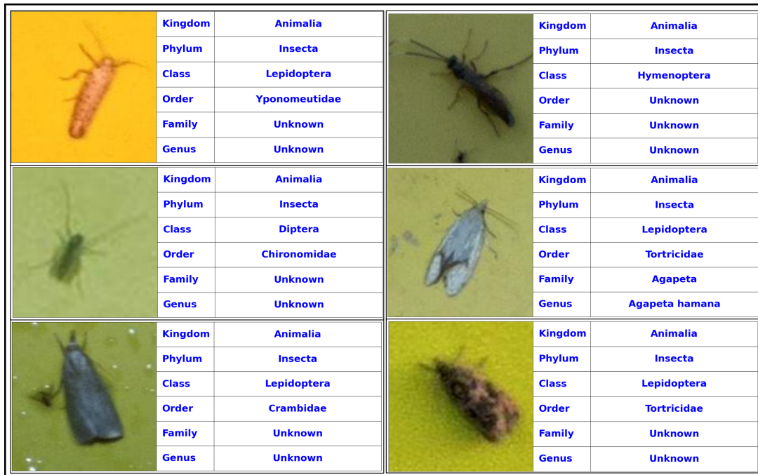
Figure 1: Visualization of insect samples with multiple taxonomic labels. The table at the bottom of each image displays the taxonomic classification with the following levels: Kingdom, Phylum, Class, Order, Family, and Genus.

The Insect classification data set from Arise Biodiversity - Diopsis challenge dataset [13] is a comprehensive collection of images for the purpose of insect detection and multi-level classification. The Diopsis dataset includes 3,965 high-resolution images (3280 x 2464 pixels) containing a total of 48,216 labeled insects. Each insect is annotated with a bounding box and a taxonomic label. For the purpose of this work we employ only the classification dataset which contains 39,445 cropped images of individual insects labeled with taxonomic level. These images are labeled at the most specific taxonomic level possible (Fig: 1), identifying each insect to the most precise classification category allowed by the data, resulting in 84 distinct "leaf" classes. A "leaf" class represents the most detailed level of classification, where the taxonomic hierarchy concludes. If an insect can be identified at the species level, that species is used as the label; otherwise, the label may be at a higher level, such as genus or family. Additionally, a CSV file is provided to map each taxon's name to its ancestors, aiding in hierarchical classification.