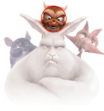
Fig. 5. Media Fragment image.jpg#circle=175,55,40 styled with CSS extension

To make Media Fragment URIs more attractive for Web designers and developers, an integration into common Web standards is essential. In this section we sketch how CSS can be adopted to Media Fragments for both spatial and temporal dimension. In our approach the fragment can be seen as an element, which