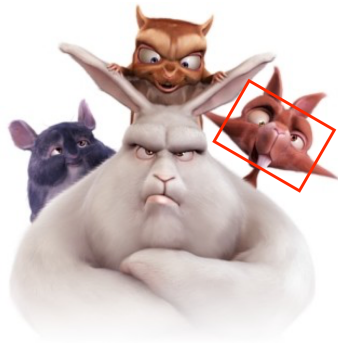
Fig. 3. Transformation Extension: image.jpg#rect=230,100,80,55&rotate=25