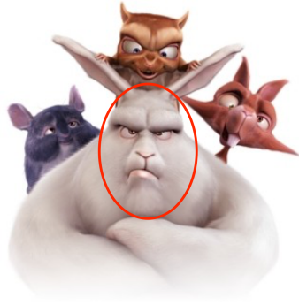
Fig. 2. Shape Extension: image.jpg#ellipse=percent:50,52,15,22