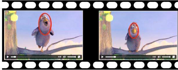
Fig. 4. Animated Transformation Extension: video.mp4#ellipse=330,100,50,80&aTranslate=0.45,0,0;0.1,-50,50&aScale=0.45,1;0.1,0.7&t=0.5,4

animated transformation type occurs more than once, only the first value is considered. Figure 4 shows how a spatial fragment is animated over time in both scale and translation. In this case there is no transformation until 45% of the temporal fragment (3.5 seconds overall), in the next 10% of time the shape translates to south-west and scales to 70%. During the remaining time there is no transformation.