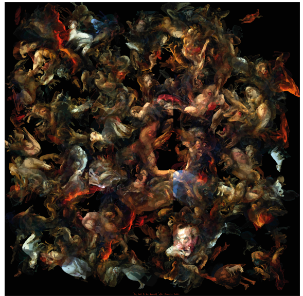
Figure 1: The Fall of the Damned after Rubens and Eaton . High-resolution collage of image patches of animals (Fig.7), optimized hierarchically with 3x3 overlapping CLIP critics.

The Collage Generator optimizes such transformations guided by a dual text-and-image encoder (Liu, Gong, and others 2021), like the popular CLIP model from OpenAI (Radford, Wook Kim, and others 2021), pre-trained on large datasets of captioned images collected on the internet (hence incorporating various cultural biases). Intuitively, the dual encoder computes a score for the match between a textual