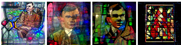
Figure 6: Alan Turing in stained glass . a) CLIPDraw with 1000 strokes, b) CLIP-CLOP with 100 animal patches or c) 200 broken plate patches, d) CLIP-guided diffusion.

Patches as Textural Image Constituents Figure 6 illustrates different aesthetics that can be obtained using diverse image generators on the same prompt ( Alan Turing in stained glass ). Without cherry-picking, we compared results on CLIPDraw (Frans, Soros, and Witkowski 2021), Katherine Crowson’s CLIP-guided diffusion (Dhariwal and Nichol