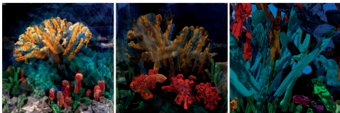
Figure 3: Rendering methods on prompt underwater coral . Left to right: transparency, masked transparency, opacity.

Achieving High Resolution CLIP-CLOP’s advantage is that it can produce collages at any resolution. During optimization, we use down-sampled patches, as CLIP is restricted to 224 \times 224 images; for the final rendering, the same spatial transformations are applied to the original high resolution patches.