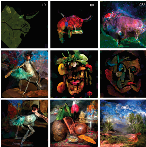
Figure 5: Collages made of different numbers of tree leaves patches (bulls in the top row), as well as Degas-inspired ballet dancers made from animals, faces made of fruit, and still life or landscape made from patches of animals (see Fig. 7).

Non-Semantic Composition from Patches In many human-made collages, the arrangement of patches is determined by their semantic relationship, e.g. a giant child may be depicted climbing atop a skyscraper. The meaning of each part is coherent or interestingly incongruous, and humans can easily construct such scenes. However, a harder task for humans is to compose an image (e.g. a bull or a human face 3 ) from semantically different parts (e.g. tree leaves or fruits), as illustrated on Figure 5. CLIP-CLOP easily makes such discoveries and compose patches in a non-semantic way. Figure 5 also shows (in the top row) that fewer patches make more abstract Picasso-inspired collages of a bull, while more patches make more realistic images.