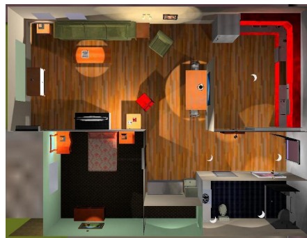
Figure 1: Virtual representation of a smart home

The smart home environment was implemented in XVR (extreme VR, University of Pisa) as Virtual representation of a real one and the P300 based BCI system was connected to it. The virtual 3D representation of a smart home with different control elements is shown in Figure 1.