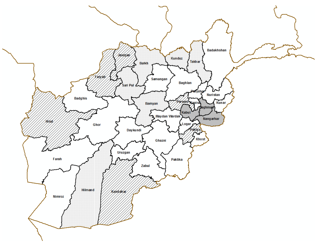
Figure 2: Distribution of beneficiary households by province.

Provinces shaded in dots comprised up to 125 beneficiary households, those in single hatching up to 250 and those shaded in grey above 250. Please refer to Table A1 in the appendix for the exact numbers.