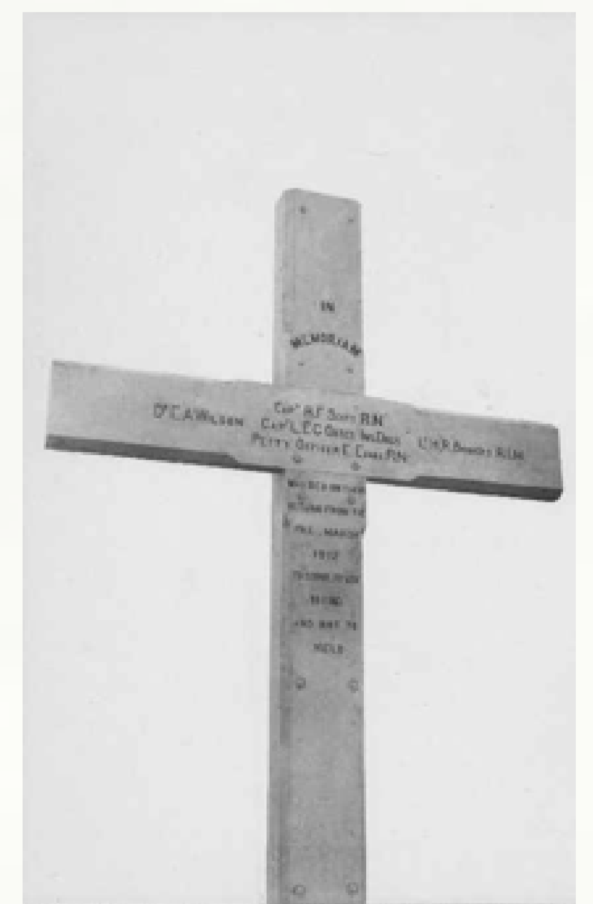
Memorial Cross on Observation Hill Private Collection

The world was informed of the tragedy on 10 February 1913, when Terra Nova reached New Zealand.