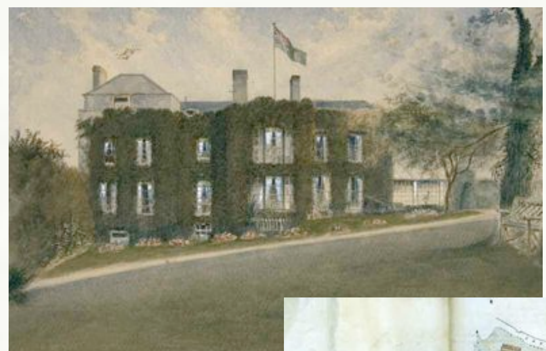
'Outlands' - Scott's childhood home. Painting by H.M.B., dated 1904.

Already a popular national hero after the Discovery Expedition, Scott married Kathleen Bruce on 2 September 1908, at Hampton Court Palace. Their only child, Peter Markham Scott, was born on 14 September 1909.