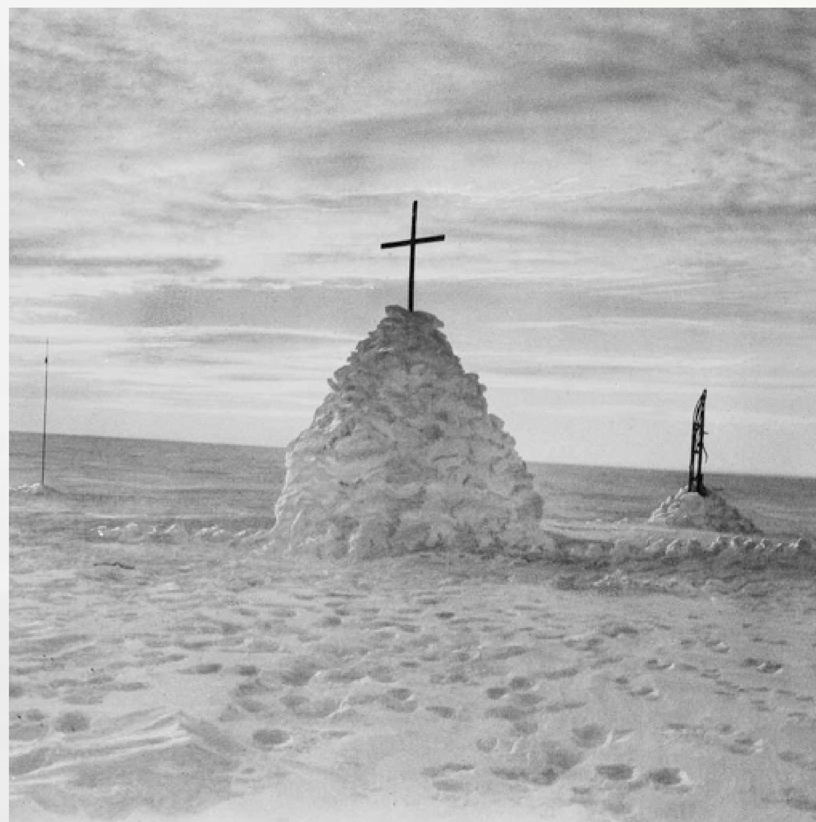
The Last Rest, 1913.