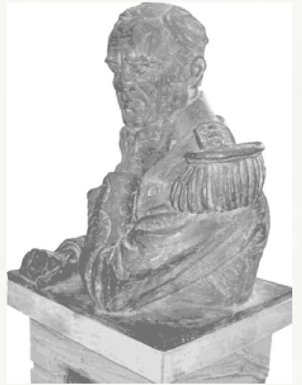
Bronze of Captain Scott by his widow Kathleen Scott, c.1913-14 - to be seen at Stoke Damerel Community College, Plymouth

When news of Captain Scott reached Britain, a Fund was set-up for the families of the men who died on the ill-fated Polar Party. Some of the money raised paid for two national memorials; the first, in St Paul's Cathedral, London, by a Plymouth born sculptor - the second, unveiled in Plymouth, at Mount Wise Park, Devonport.