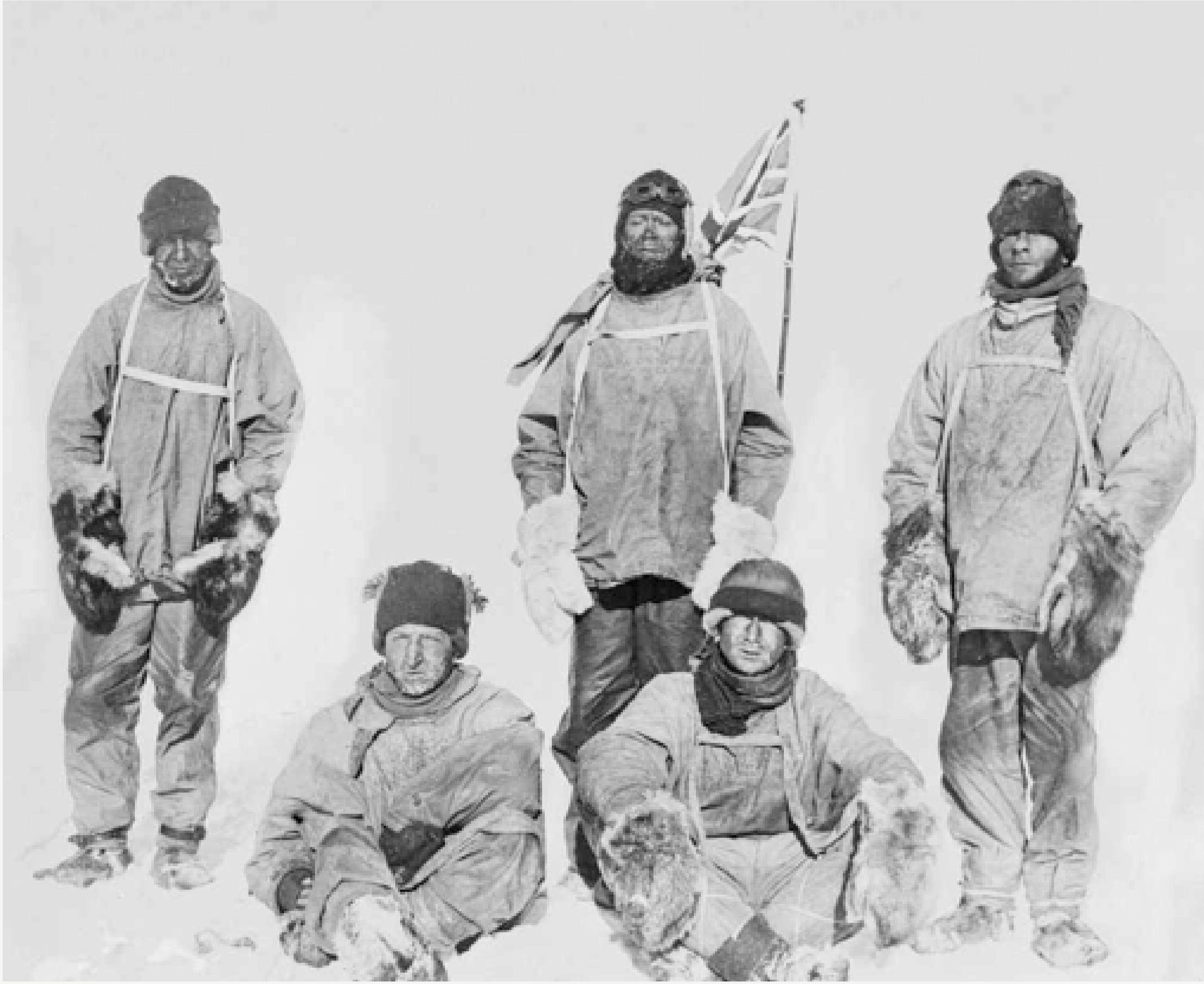
The Polar Party at the South Pole, 1912. (Left to right: Oates, Bowers, Scott, Wilson and Evans)

The overall success of the first British Antarctic Discovery Expedition (1901-04) put Scott in the public eye. He was promoted to Captain, created a Commander of the Royal Victorian Order and awarded a cluster of honours and medals, some from overseas. However, it was following the events of the second, ill-fated, British Antarctic Terra Nova Expedition (1910-13) that Scott's fame was secured.