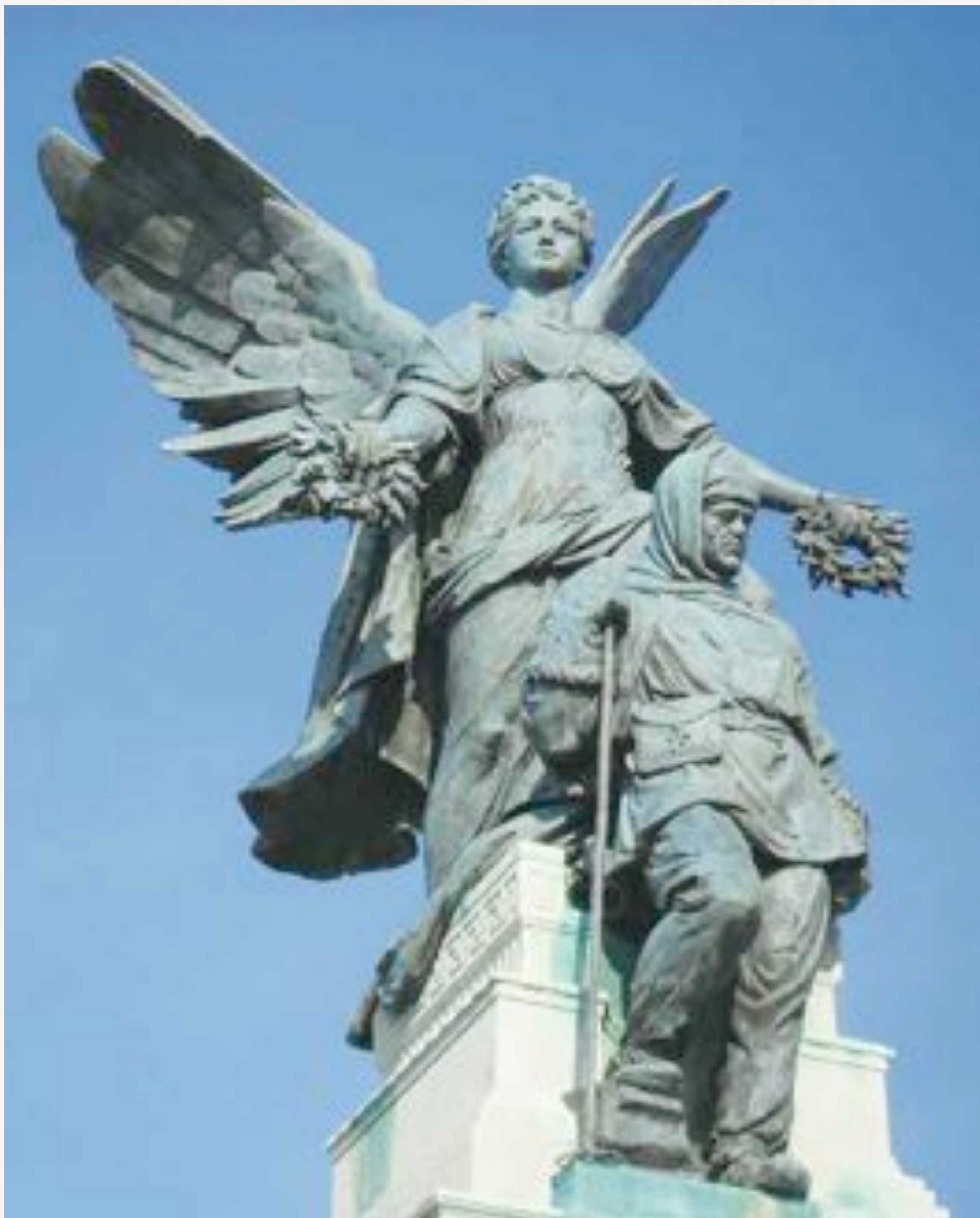
National Memorial at Mount Wise, Devonport, 2011- the bronze figure of Courage