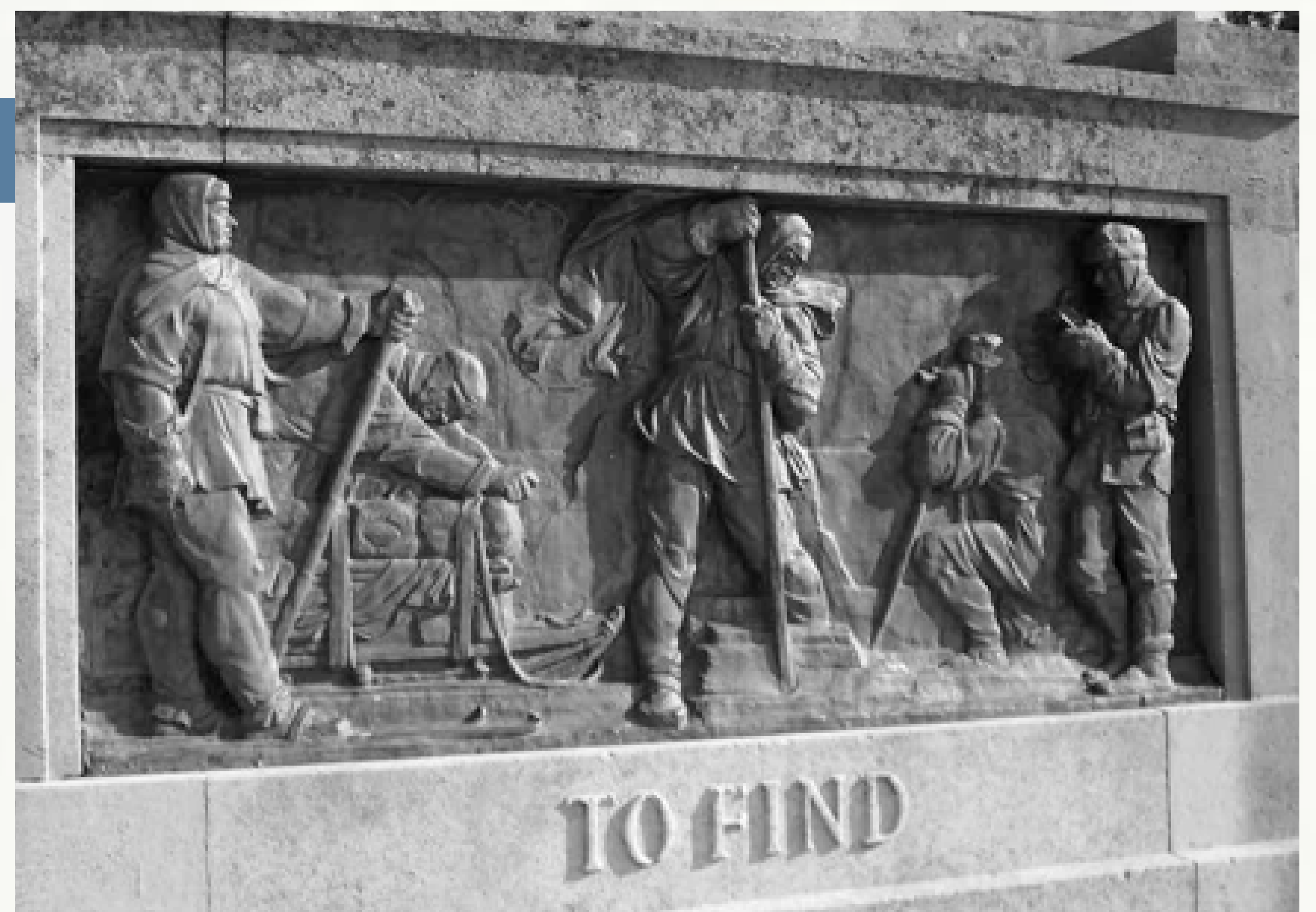
The Polar Party reach the Pole - bronze panel on the National Memorial to Scott and the Polar Party, Devonport

The Plymouth Memorial was designed in 1913-14 by Albert H. Hodge (1875-1917). It is in the form of an obelisk, supporting a statue representing Courage , supported by Devotion and crowned by Immortality . Four bronze relief panels show Scott's journey to the South Pole and five bronze medallions feature portraits of the ill-fated Polar Party