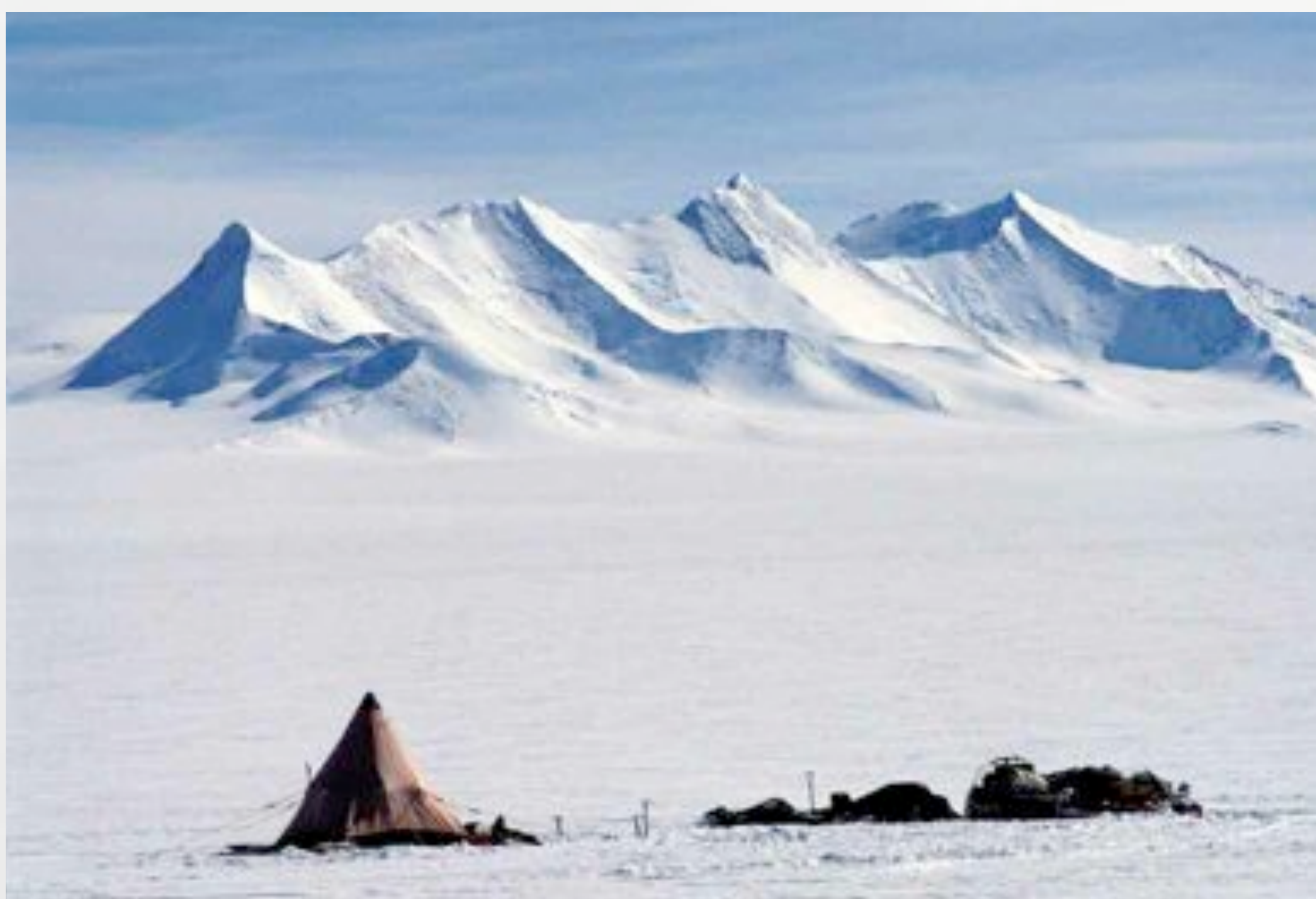
British Antarctic Survey 'Field Camp', c.2000