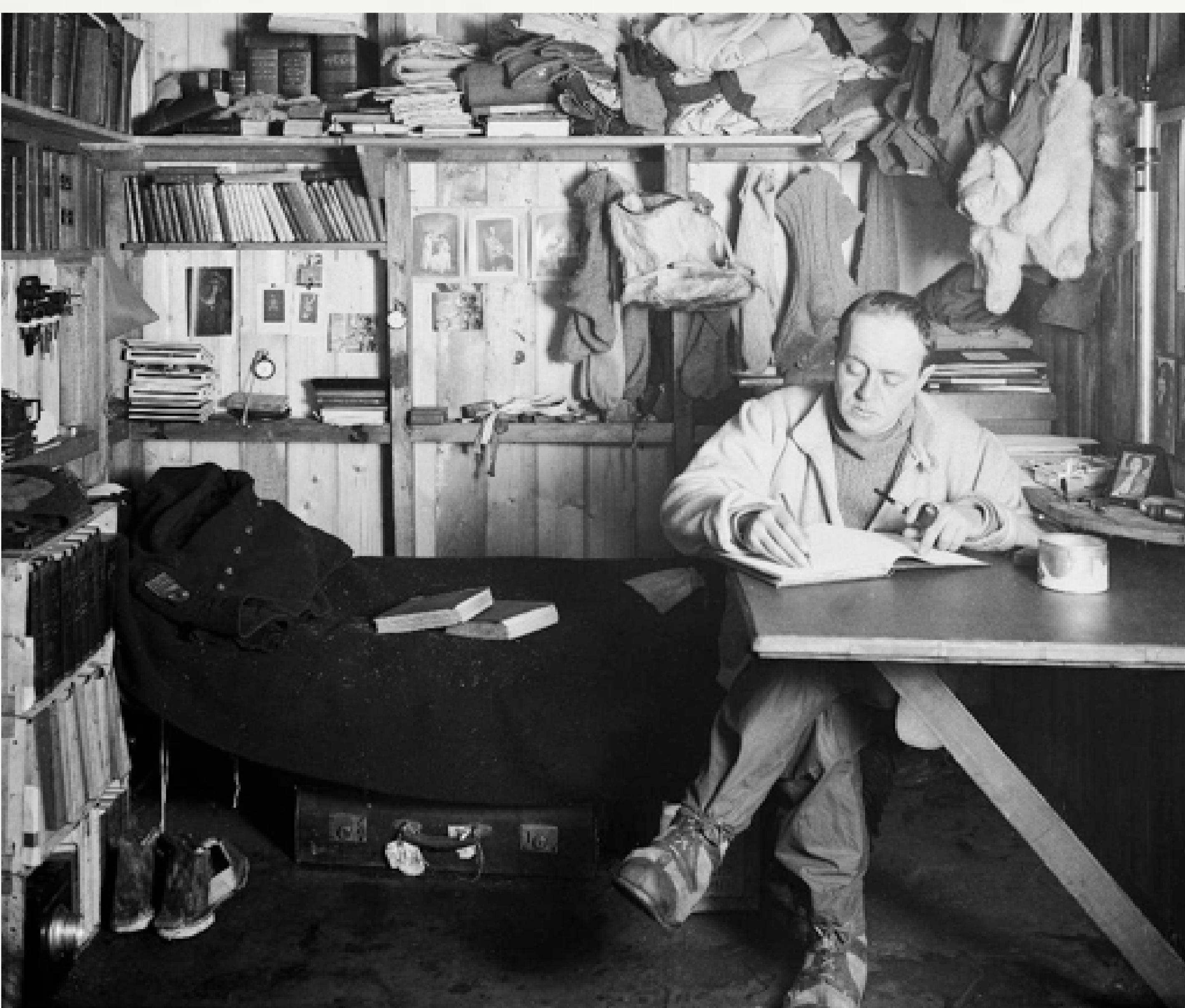
Captain Scott writing his journal in the Winterquarters Hut, October 1911.