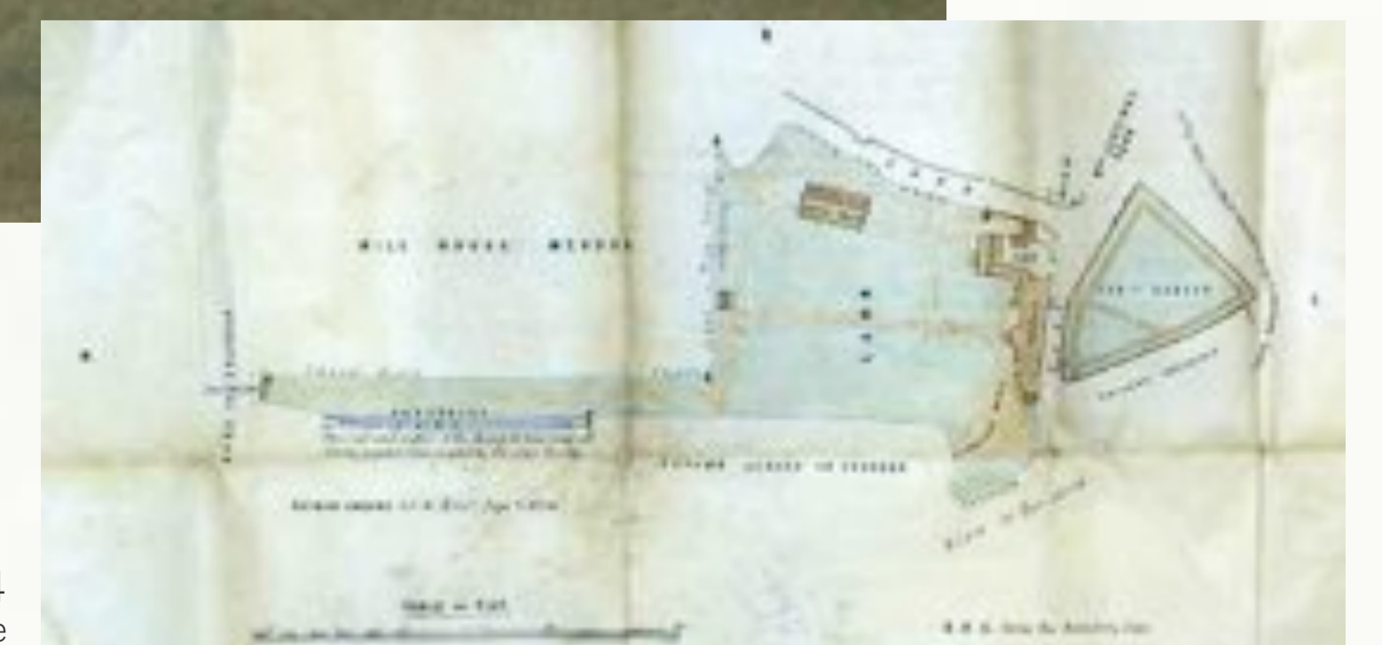
Ground plan of 'Outlands', 1864 Plymouth and West Devon Record Office