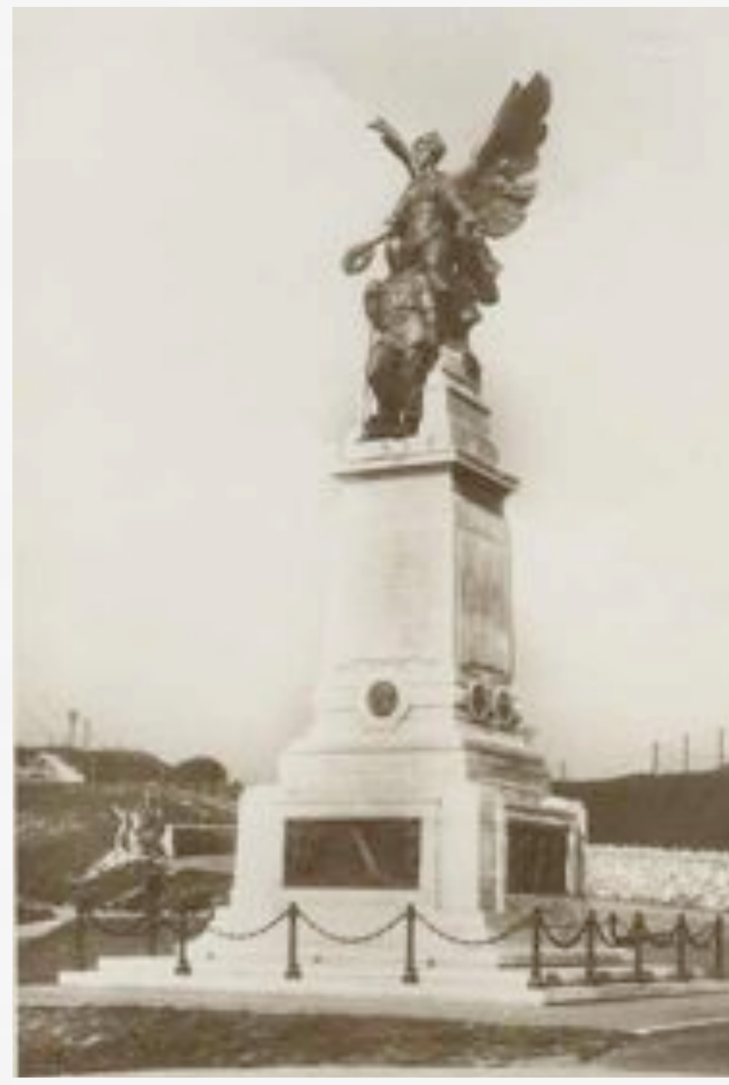
The National Memorial to Scott and the Polar Party, Devonport, c.1930