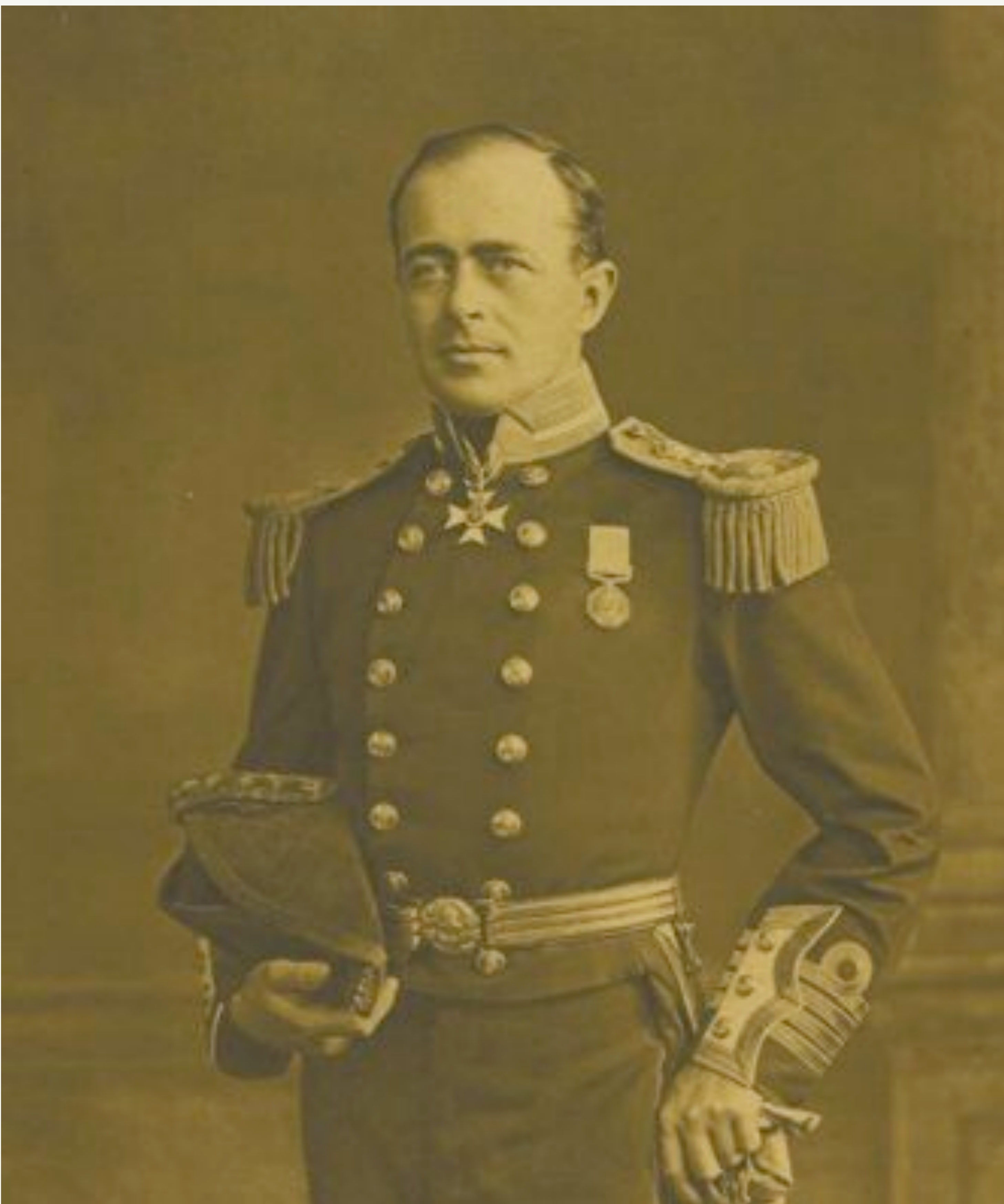
Robert Falcon Scott, in full dress uniform with Polar Medal, 1905

In 'An Empire of Ice: Scott, Shackleton, and the Heroic Age of Antarctic Science' Edward Larson argues it is not about being first to the Pole, but who did the best science along the way. " Science gave meaning to the death of Scott and his men... " Scott's failings are outweighed by his scientific legacy.