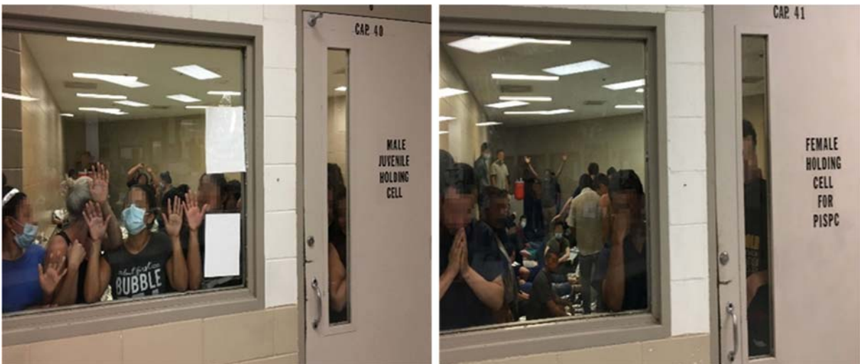
Figure 5. Fifty-one adult females held in a cell designated for male juveniles with a capacity for 40 (left), and 71 adult males held in a cell designated for adult females with a capacity for 41 (right), observed by OIG on June 12, 2019, at Border Patrol’s Fort Brown Station.

We are concerned that overcrowding and prolonged detention represent an immediate risk to the health and safety of DHS agents and officers, and to those detained. At the time of our visits, Border Patrol management told us there had already been security incidents among adult males at multiple facilities. These included detainees clogging toilets with Mylar blankets and socks in order to be released from their cells during maintenance. At one facility, detainees who had been moved from their cell