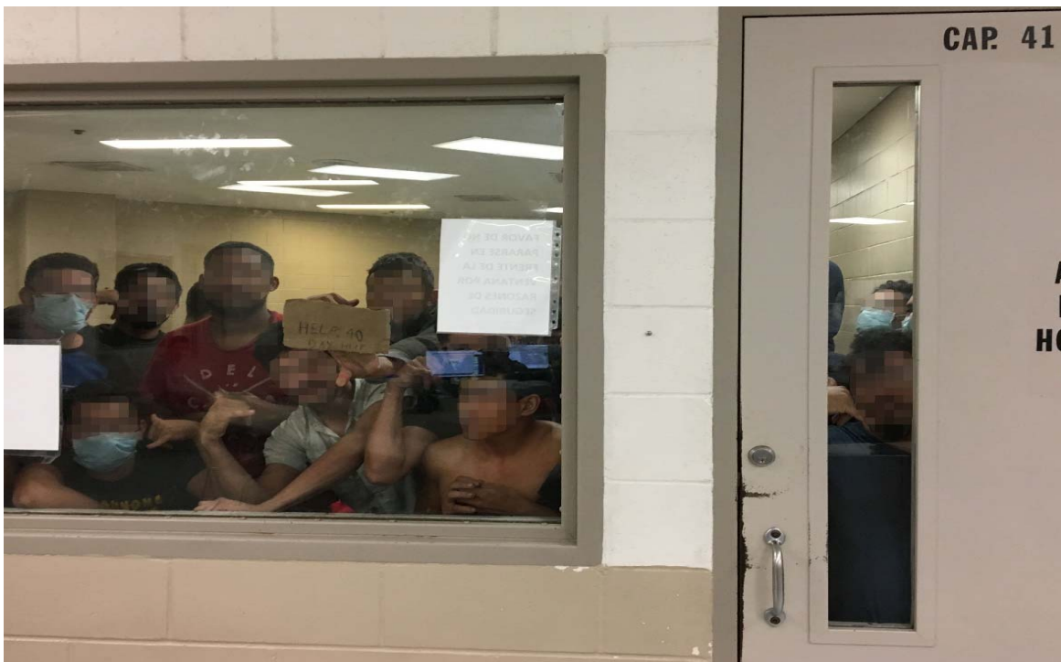
Figure 6. Eighty-eight adult males held in a cell with a maximum capacity of 41, some signaling prolonged detention to OIG Staff, observed by OIG on June 12, 2019, at Border Patrol’s Fort Brown Station.

Senior managers at several facilities raised security concerns for their agents and the detainees. For example, one called the situation “a ticking time bomb.” Moreover, we ended our site visit at one Border Patrol facility early because our presence was agitating an already difficult situation. Specifically, when detainees observed us, they banged on the cell windows, shouted, pressed notes to the window with their time in custody, and gestured to evidence of their time in custody (e.g., beards) (see figure 6).