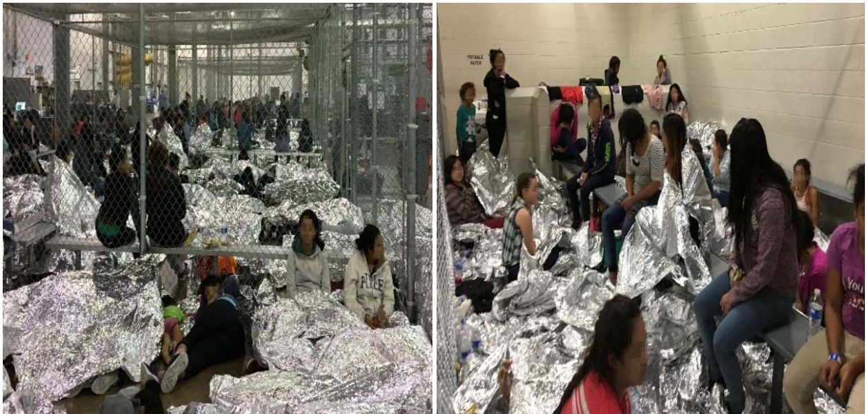
Figure 2. Overcrowding of families observed by OIG on June 11, 2019, at Border Patrol’s McAllen, TX, Centralized Processing Center.