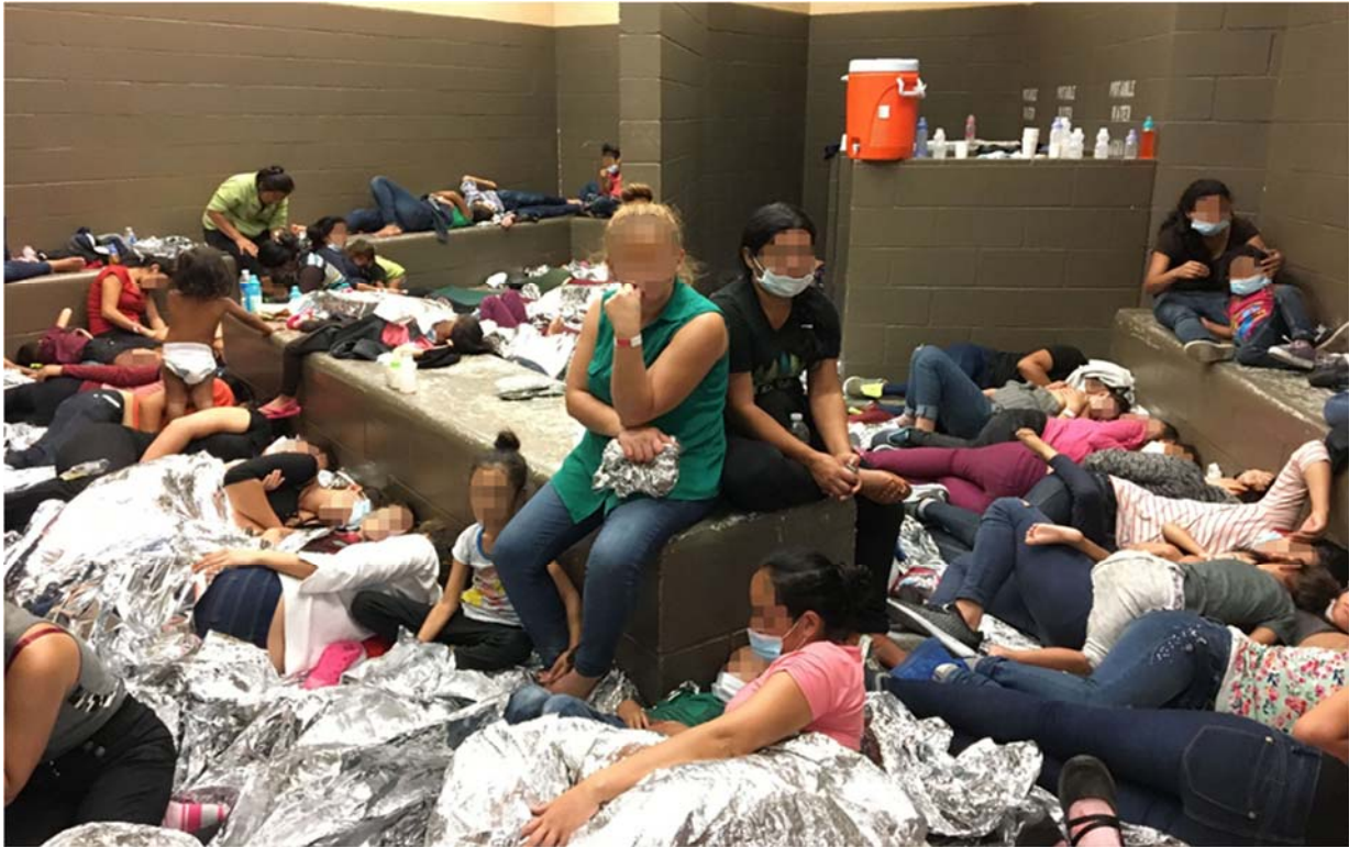
Figure 3. Overcrowding of families observed by OIG on June 11, 2019, at Border Patrol’s Weslaco, TX, Station.

In addition to the overcrowding we observed, Border Patrol’s custody data indicates that 826 (31 percent) of the 2,669 children 6 at these facilities had been held longer than the 72 hours generally permitted under the TEDS standards and the Flores Agreement. 7 For example, of the 1,031 UACs held at the Centralized Processing Center in McAllen, TX, 806 had already been processed and were awaiting transfer to HHS custody. Of the 806 that were already processed, 165 had been in custody longer than a week.