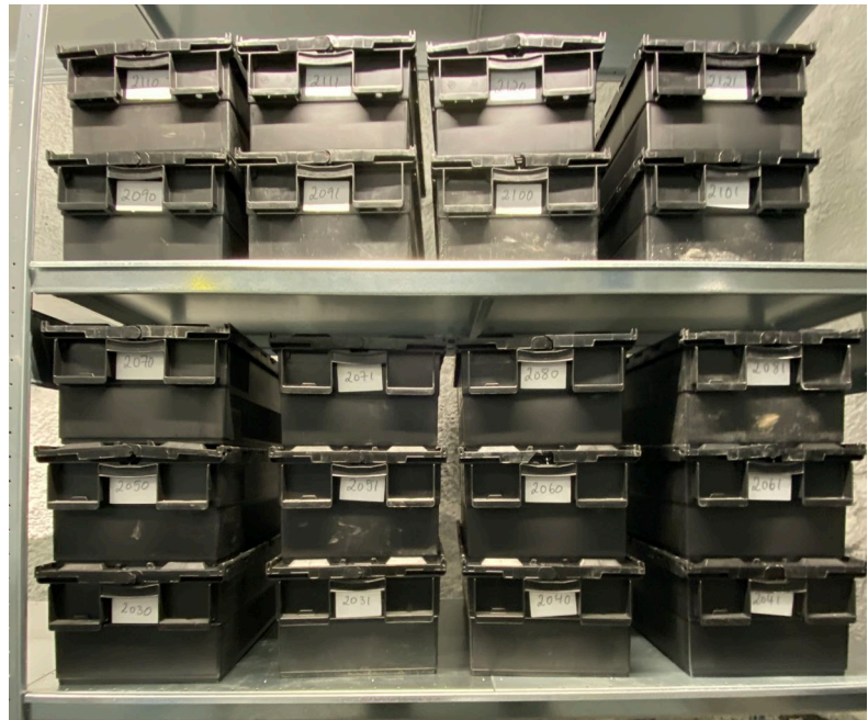
Figure 5. The seed samples for the 100 year experiment have preliminary been placed in standard black plastic boxes in storage hall 1. Towards the end of the establishment period, NordGen will move the experimental seed samples to smaller boxes that clearly distinguish the experiment from regular seed deposit boxes in the Seed Vault.

No activities have taken place in the 100 year Seed Storage Experiment in the Coal Mine in 2021. Only rent for the storage in the mine has been charged to the Seed Vault budget in 2021.