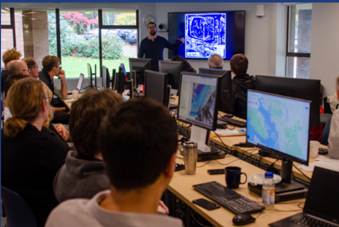
NESDIS-run workshops on digital elevation models give local scientists and emergency managers the knowledge required to develop and update DEMs used in modeling and planning for a resilient community.

Capacity-building fosters collaboration and coordination, as well as capability to use NESDIS information and products.