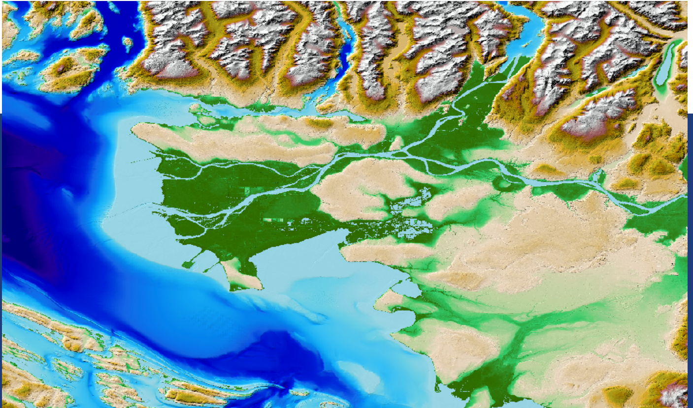
NESDIS digital elevation model maps the seafloor near coastal communities.