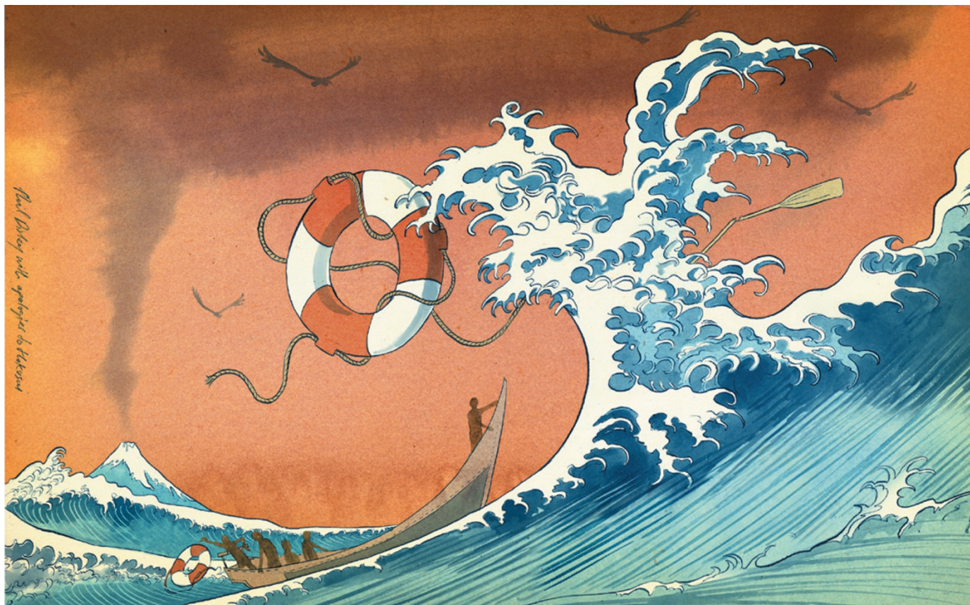
ILLUSTRATION BY PHIL DISLEY

FUNDING Australia's grant system wastes centuries of researchers' time p.314