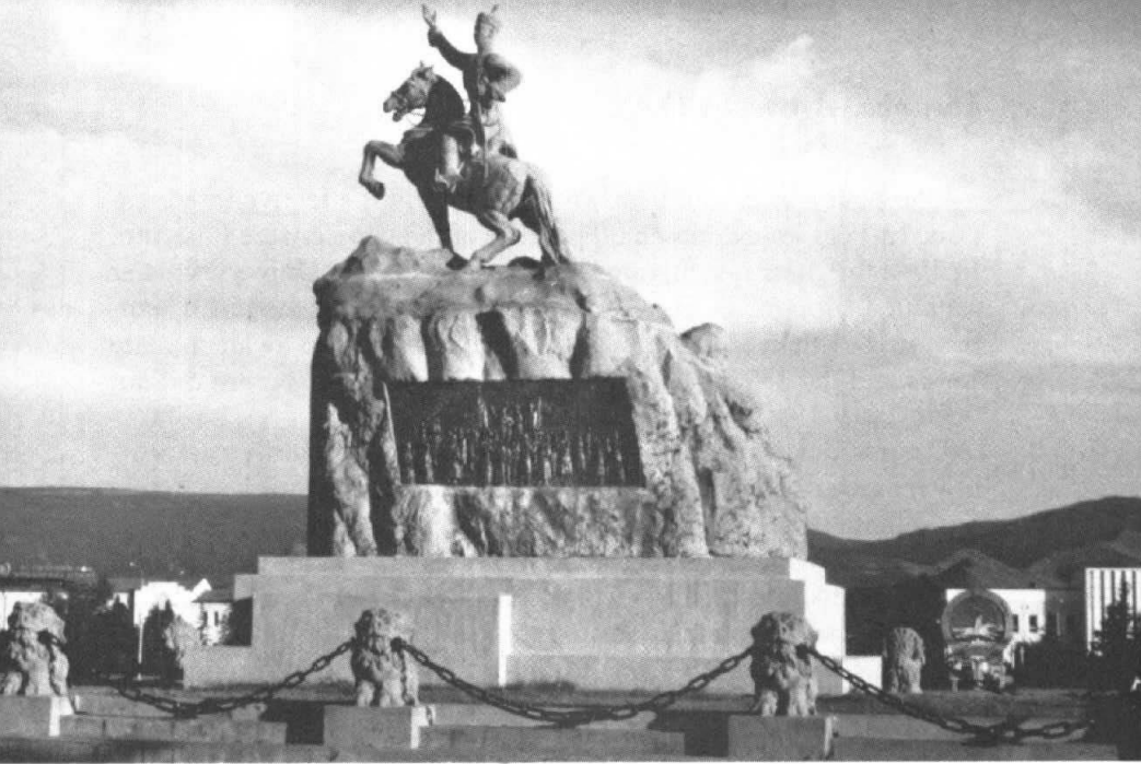
Monument to Sukhe Bator, Ulaanbaatar

and military aid. In 1936 military expenditures were doubled, and by 1938 more than half of Mongolia's budget was for defense. The government built paved roads, extended railroads, and established military air bases and communication lines, all with Soviet aid. Military equipment and training also were supplied by the Soviet Union. It is estimated that during World War II the Mongolian Army numbered between 80,000 and 100,000 troops, a huge percentage of the total population of 900,000.