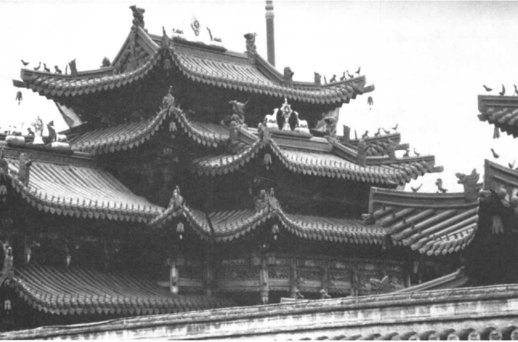
The Bogdo Khan's palace, now a museum, Ulaanbaatar

formalization of Mongolian-Soviet relations then was accelerated. On November 5, 1921, a bilateral Agreement on Mutual Recognition and Friendly Relations was signed in Moscow. It recognized the People's Government of Mongolia, and it facilitated the exchange of diplomatic representatives. Furthermore, it provided for the self-determination of Tannu Tuva (see Glossary), a region in northwestern Mongolia that had been a Russian protectorate between 1914 and 1917.