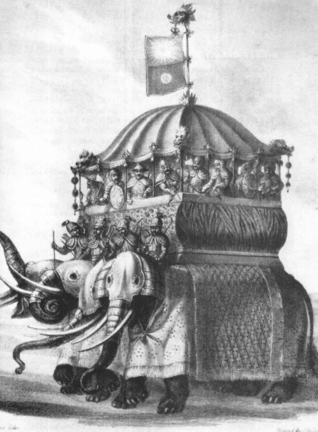
Elephants carrying Khubilai Khan's command post in battle