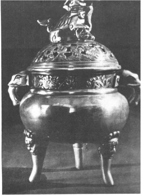
Seventeenth-century incense burner

this way, the Russians had reached the Amur Valley and the Pacific Ocean by mid-century. In the period between 1641 and 1652, the Russians gradually conquered the Buryat Mongols, thereby gaining control of the region around Lake Baykal. The Manchus observed with considerable apprehension Russia's growing pressure on the Turkic peoples and the Mongols of Inner Asia. As early as 1653, there were clashes between Manchus and Russians in the Amur Valley. In 1660 the Manchus ejected the Russians from the Amur region, only to see them reappear when the Manchus became occupied with internal troubles in southern China.