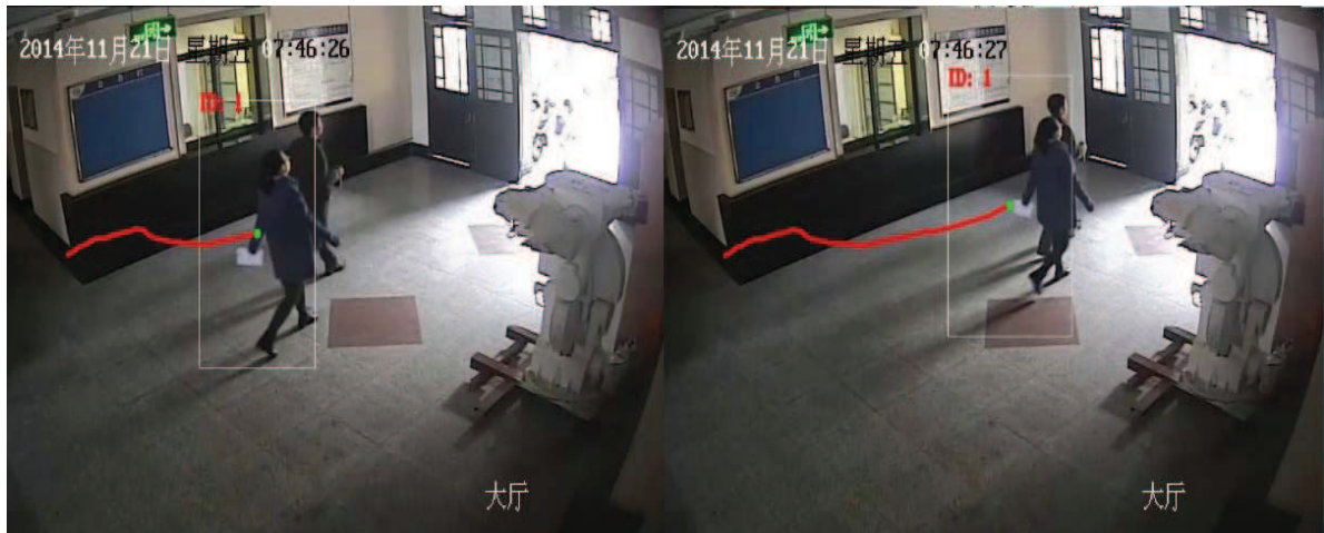
FIGURE 3. Gate 1.

Because the resolution of the selected video sequences is relatively high ( 960 \times 576 ), the time cost is a little higher, achieving only quasi real-time level. Table 1 shows the average processing time cost per frame. When the number of objects increases, the time consumption also increases.