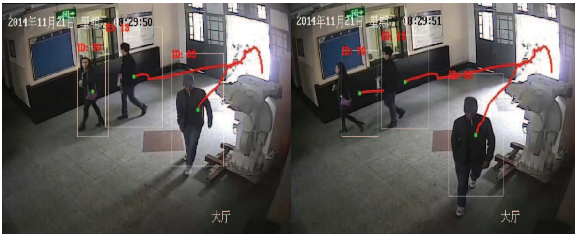
FIGURE 4. Gate 2.