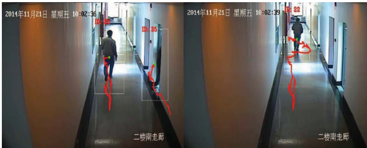
FIGURE 2. Corridor.