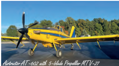
Aircraft AT-602 with 5-blade Propeller MTV-27