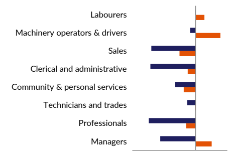
Chart 1: Internet job vacancies by industry

The number of vacancies across regional Northern Territory in the month increased by 0.5% to 996, with 'managers' (up by 9.3%) and 'sales workers' (up by 6.8%) reporting the largest increases. In annual terms, the number of regional job vacancies decreased by 5.0%.