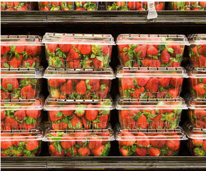
Strawberries for sale in chilled store shelving