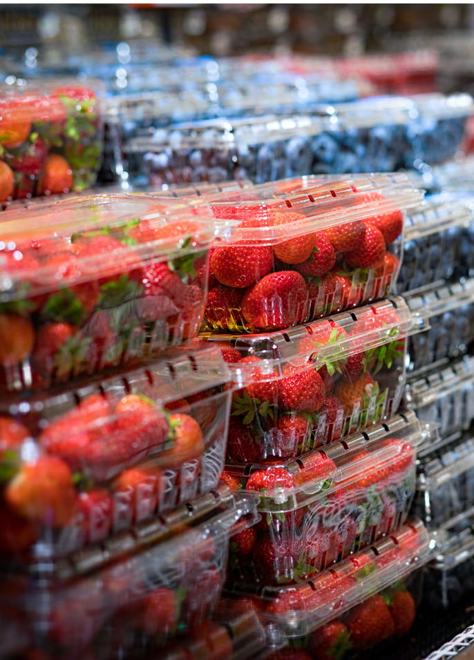
Photo Credit: Adobe Stock Photos may not be reproduced without permission.

Enhanced demand planning refers to software using machine learning and predictive analytics to better estimate store order sizes. An ideal system optimizes fresh produce and takes into account variables such as inbound shipments, recent and historical sales, promotions, inventory levels, display sizes, seasonality, and perishability to make accurate store orders that need minimal intervention. More accurate ordering results in less product sitting in the backroom, reducing the amount of time products age but are not available for sale. Less human intervention in system-generated orders also saves labor. One retailer in this study uses Afresh software designed specifically to generate produce store orders and has seen a significant improvement in reducing backroom stock. In a sampling of Afresh's clients' data, strawberry waste was reduced by 15.5% after implementing its software.