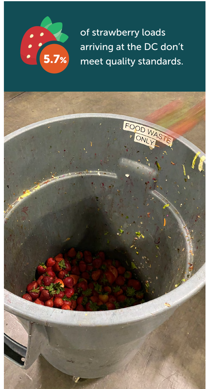
Strawberries destined for composting after quality control process at DC.

5.7% of strawberry loads arriving at the DC don't meet quality standards, but about half of these miss the cutoff by a small amount and are nonetheless accepted. These berries may have a higher chance of becoming food waste downstream. The other half of rejected loads are redirected to processing, donation, or accounted as loss in the cooler stage.