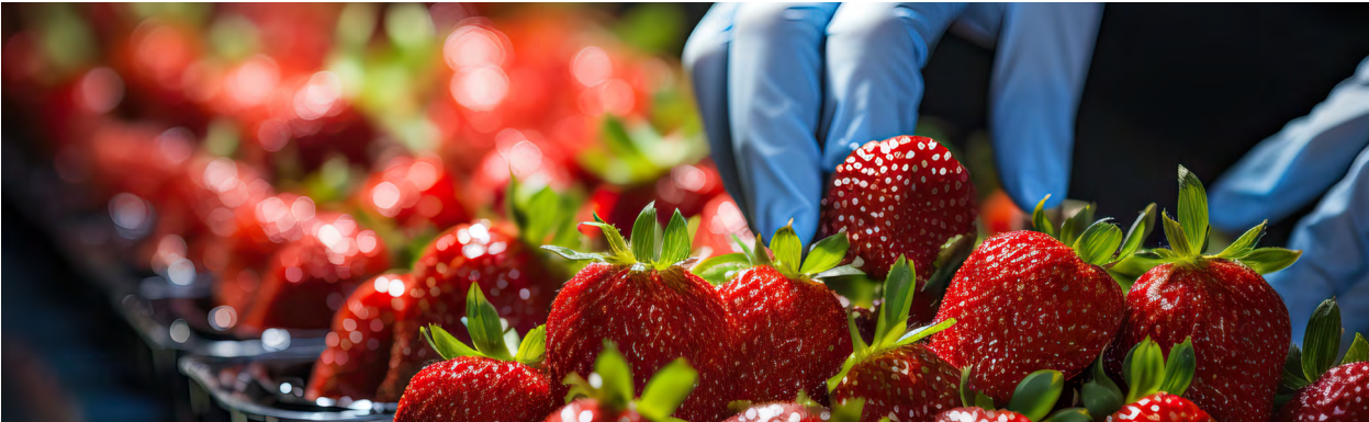
Photos may not be reproduced without permission.