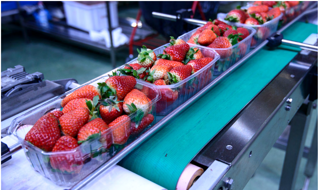
Photo Credit: Adobe Stock Photos may not be reproduced without permission.

This solution also unlocks the potential to sell edible berries through secondary channels, such as Planet Harvest , Full Harvest , and Misfits Markets , whose mission is to utilize more of the on-farm surplus being wasted today. These channels pay growers at least 13% more per pound than traditional secondary channels, such as juicing or frozen, which are often saturated by mid-season, helping to improve growers' economic prosperity.