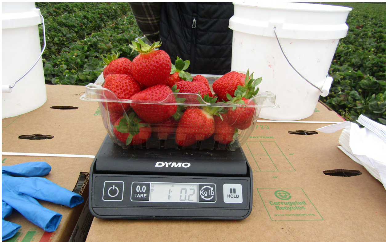
Photo Credit: Measure to Improve LLC Photos may not be reproduced without permission.

The Pacific Coast Food Waste Commitment (PCFWC) arose out of the Pacific Coast Collaborative in 2016 and is an innovative public-private partnership made up of West Coast jurisdictions, U.S. food industry leaders, and nonprofit resource partners that together seek to eliminate food waste in the region by 50% by 2030. Learn more about the initiative and its members at pacificcoastcollaborative.org/food-waste .