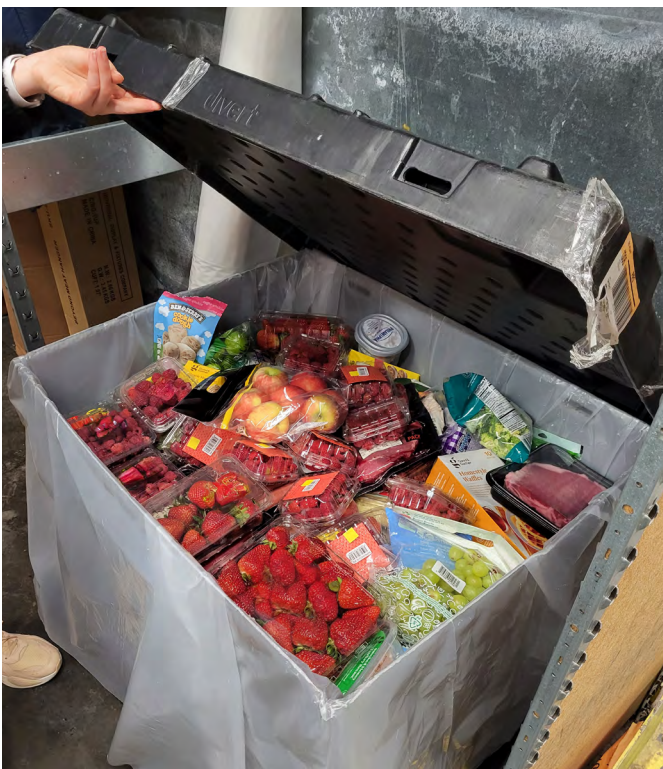
Large bin in back of store with material for composting facility (de-packaging done later)