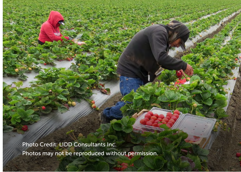
Photo Credit: LIDD Consultants Inc. Photos may not be reproduced without permission.