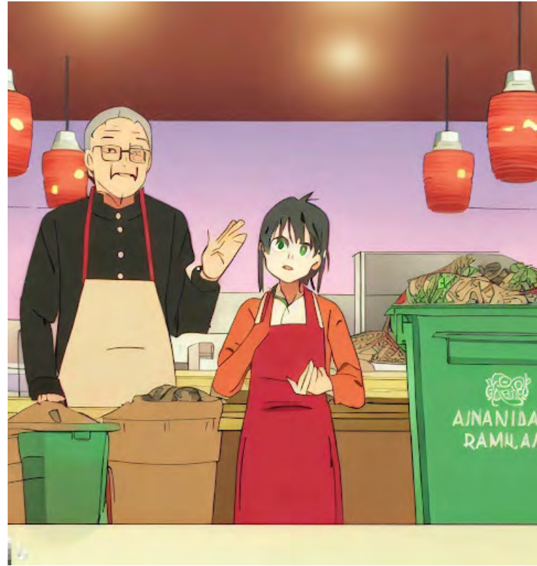
Illustration: Restaurant owners sort recycling and compost behind the counter with limited space. Bing Image Creator & Shu-Yi, L. (2023, July 2).

At the start of the project, six out of the 17 businesses in Chinatown to receive TBA outreach were subscribed to recycle service. By the end of the project, five additional Chinatown businesses that received TBA outreach subscribed to recycle service. Overall, across all of Oakland Chinatown during the same time period, recycle compliance increased by 12.86%. Four out of the five newly compliant TBA outreach businesses had also received a Notice of Violation for lack of composting services. Across Chinatown during the same time period, two additional businesses who did not receive TBA outreach did receive NOVs for being out of compliance with composting. Both signed up for recycle service. Though the NOV was about compost service, it could have been enough to remind businesses to sign up for recycle service as well.