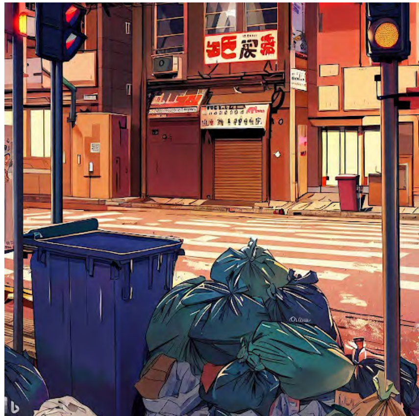
Illustration: Illegal dumping piles on a Chinatown street corner. Bing Image Creator & Shu-Yi, L. (2023, July 2).