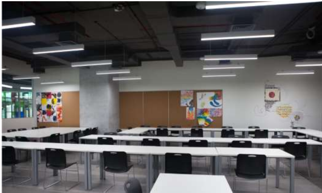
Studio / Workshops