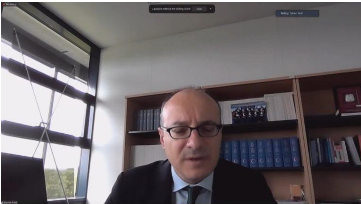
Tiranë - Konferenca XV Ndërkombëtare e Komisionerëve të Informimit