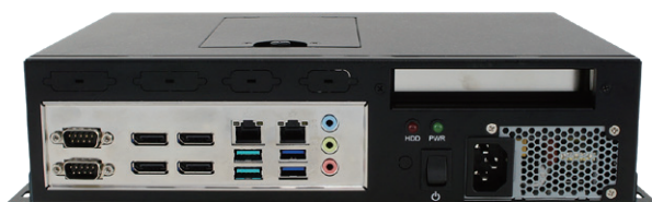
Rear I/O (Based on MI989 I/O)