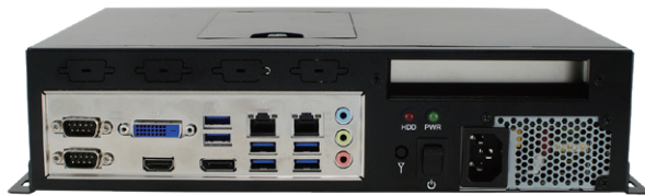
Rear I/O (Based on MI999 & MI992VF-7820 & MI991 & MI990 I/O)

CMI211-999 / CMI211-992VF-7820 / CMI211-991 / CMI211-990 / CMI211-989