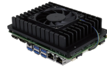
IB956 with Heatsink