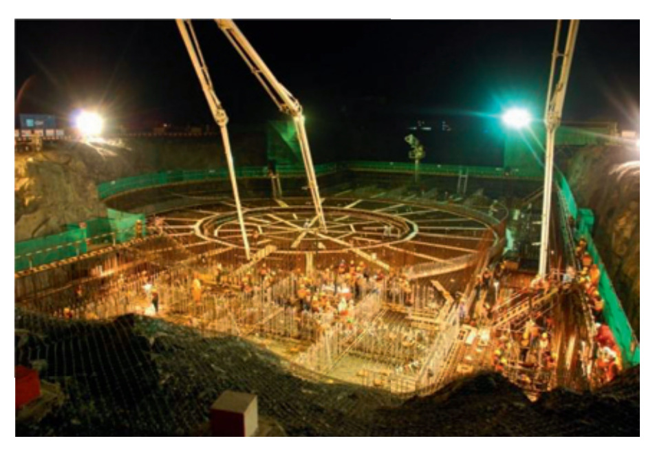
FIG. 1. Pouring the first concrete at the Sanmen nuclear power project site in China.

At the end of 2010, 24 countries were planning to expand their existing nuclear programmes, and of the 66 reactors under construction, all but one were in countries that are expanding or are planning to expand their existing programmes (Fig. 1). Any increase in the use of nuclear power is expected to occur largely through the expansion of existing nuclear power programmes. In 2010, the Agency therefore initiated new activities on expanding