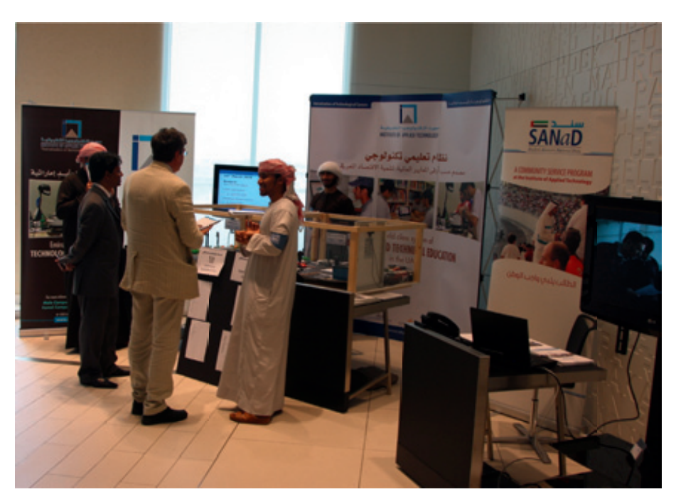
FIG. 2. One focus of the Abu Dhabi conference was on demonstrations of human resource related tools and methods.

Specific enhancements were implemented in 2010 at the Kozloduy nuclear power plant in Bulgaria and at all nuclear power plants in Ukraine, including a methodology for knowledge loss risk assessment. Another knowledge management assistance team suggested that the Russian National Nuclear Research University enhance cooperation with nuclear power plants and research institutes employing graduates by inviting industry experts to give lectures, seminars