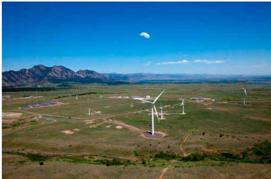
Open landscape with wind turbines.