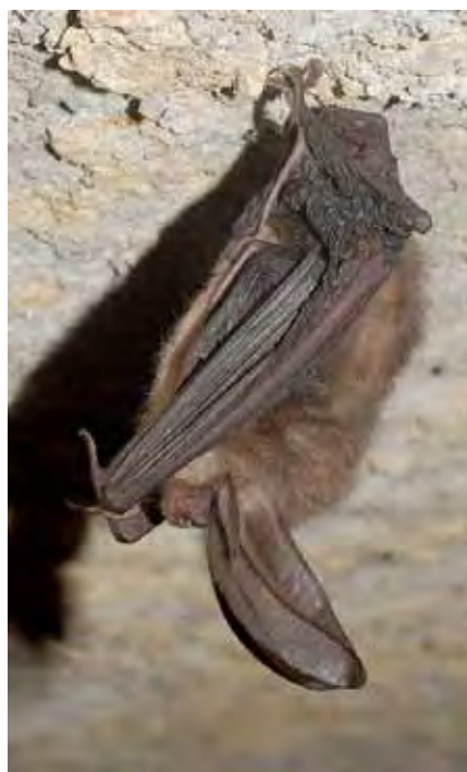
Virginia big-eared bat.

post-construction data in the areas of interest and reference areas is possible, then the Before-After-Control-Impact (BACI) is the most statistically robust design. The BACI design is most like the classic manipulative experiment. 6 In the absence of a suitable reference area, the design is reduced to a Before-After (BA) analysis of effect where the differences between pre- and post-construction parameters of interest are assumed to be the result of the project, independent of other potential factors affecting the assessment area. With respect to BA studies, the key question is whether the observations taken immediately after the incident can reasonably be expected within the expected range for the system (Manly 2009). Reliable quantification of impact usually will include additional study