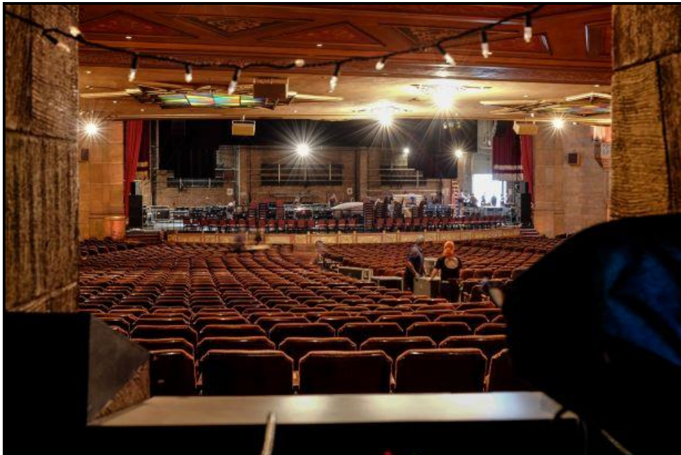
STAGE VIEW FROM FOH SOUND BUNKER