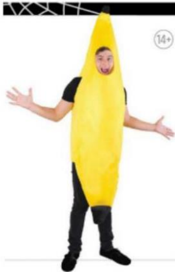
KANGAROO ITEM 10477